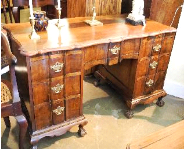
Lot # 218

217 19th. century covered pot. $20 - $30