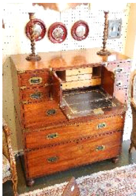
Lot # 277

277 Georgian brass bound inlaid mahogany secretaire campaign chest in two piece. $1,500 - $2,000