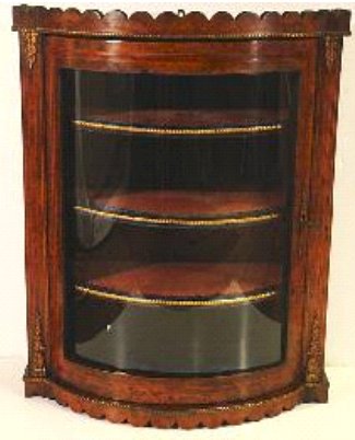
Lot # 259

249 Dresden china figured two handled basket, length 5 1/4 in. $100 - $150 250 Victorian inlaid wooden dresser box fitted with four bottles. $150 - $200 251 Pair of gilded glass bases. $50 - $100 252 Pair of early 19th. century cut crystal oval shaped decorated dishes, length 8 1/4in. $75 - $125 253 English tortoise shell dresser box. $50 - $75 254 St. Cloud ironstone platter. $50 - $75 255 Oil on board signed P.Jerome, 19 in. x 23 in., "Wild Flowers". $100 - $150 256 Two Egyptian watercolours purchased in Egypt in 1930's. $25 - $50 257 Georgian wedding sampler, 12 1/4 in. x 11 1/4 in. $100 - $150 258 Watercolour signed E. Sartain 9 1/2" x 11 1/2" "Still Life". $75 - $100