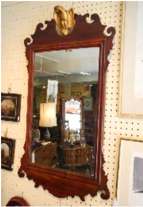
Lot # 263