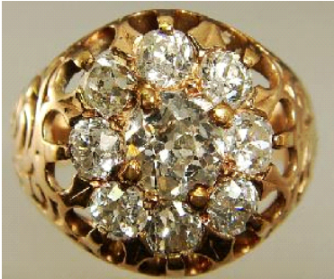
Lot # 76

226 Apprentice's mahogany chest of three drawers. $75 - $125