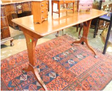
Lot # 227

227 Claw footed mahogany hall table. $150 - $250