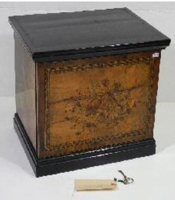
Lot # 274