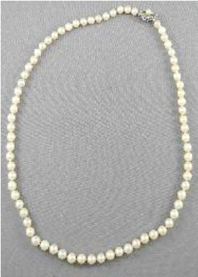
Lot # 62

61 Lady's 18k gold and emerald ring. $300 - $500