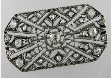
Lot # 55

54 18k yellow gold diamond and emerald ring, with Birks appraisal. $150 - $250