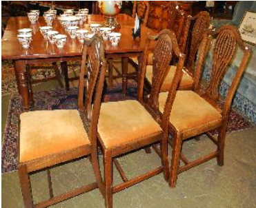
Lot # 150