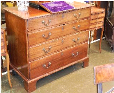
Lot # 275