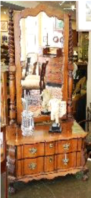
Lot # 244

243 Sculpture by Geoffrey Rock height "Male Torso". $200 - $300