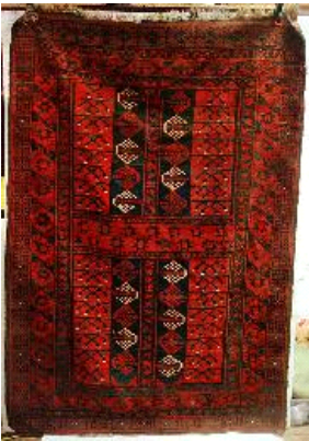
Lot # 229

228 19th. century mahogany butler's tray top table. $100 - $200