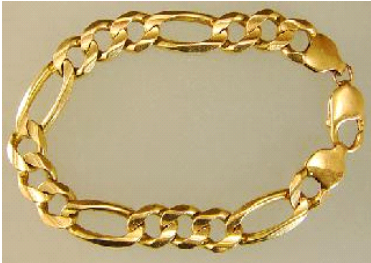
Lot # 81

81 14k yellow gold bracelet- 38 grams. $700 - $900