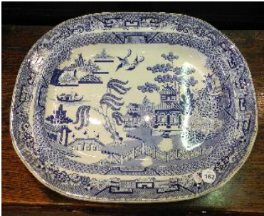
Lot # 162