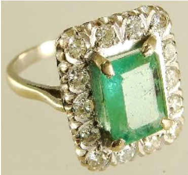
Lot # 61

61 Lady's 18k gold and emerald ring. $300 - $500