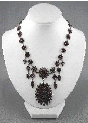
Lot # 58