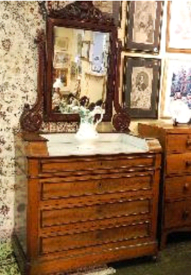
Lot # 142