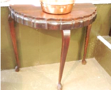
Lot # 211

211 19th. century stinkwood table. $100 - $200