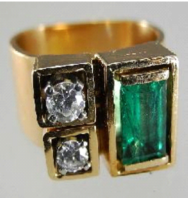
Lot # 73

73 14k yellow gold emerald and synthetic diamond ring. $400 - $600