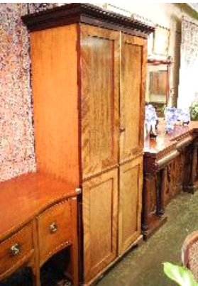
Lot # 191