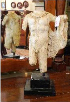
Lot # 243

56 14k yellow gold and Amethyst ring. $150 - $250