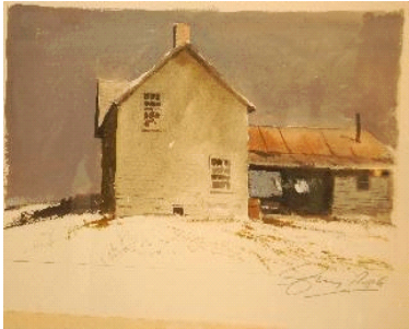
Lot # 266