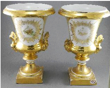
Lot # 238