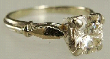
Lot # 87

86 18 kt. gold and ruby ring. $100 - $125