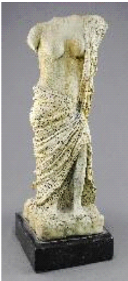
Lot # 214

213 Bronzed finish sculpture after Alexander Archipenko, ht 22", "Abstract Figure". $200 - $300