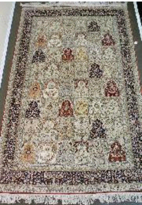
Lot # 12