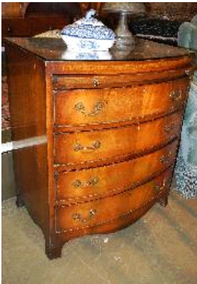
Lot # 150A