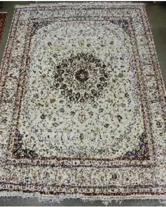
Lot # 146