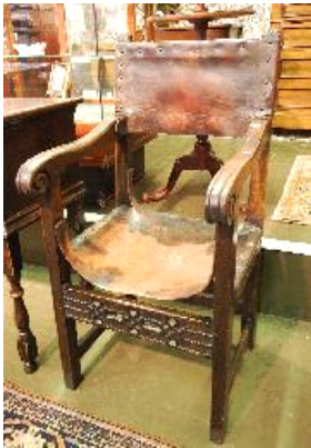
Lot # 157