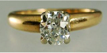
Lot # 84

84 10K yellow gold and diamond solitaire ring with original receipt and appraisal. $400 - $600