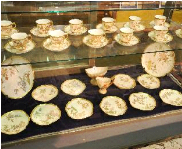
Lot # 1