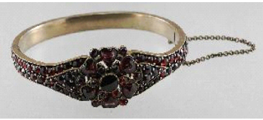
Lot # 59