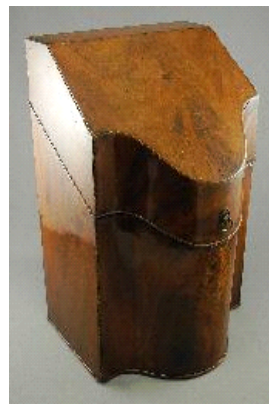
Lot # 278

277 Georgian brass bound inlaid mahogany secretaire campaign chest in two piece. $1,500 - $2,000