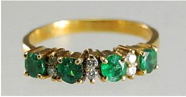
Lot # 54

54 18k yellow gold diamond and emerald ring, with Birks appraisal. $150 - $250