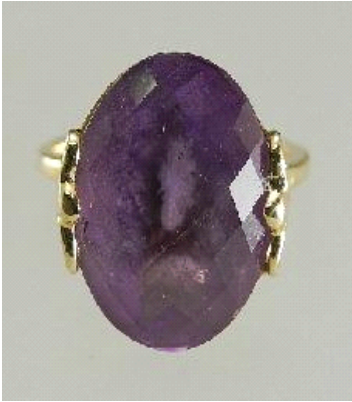
Lot # 56

55 Early 20th century 14k white gold silver top diamond plaque brooch, with appraisal. $1,000 - $1,250