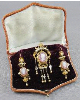
Lot # 57