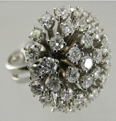
Lot # 60