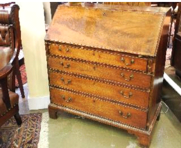
Lot # 169