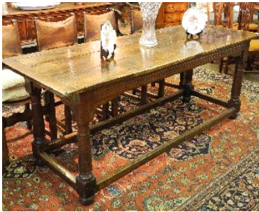
Lot # 156