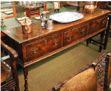
Lot # 165