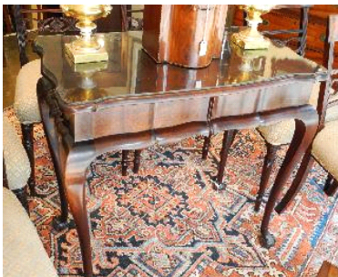
Lot # 237

236 19th. century stinkwood fireside bench. $50 - $100