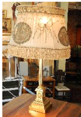
Lot # 279

278 Georgian inlaid mahogany knife box converted into a letter box. $150 - $300