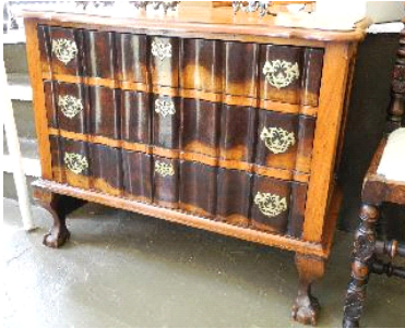
Lot # 232

231 Two cast iron strut frames. $40 - $60