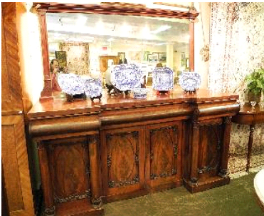
Lot # 187