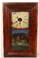
Lot # 440