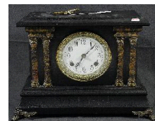
Lot # 435