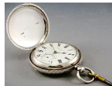
Lot # 484