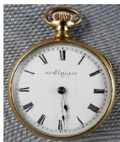
Lot # 475