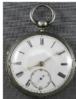
Lot # 483