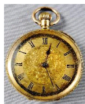
Lot # 476