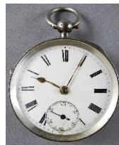
Lot # 481