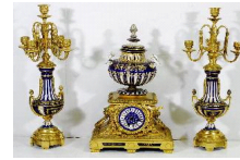
Lot # 423