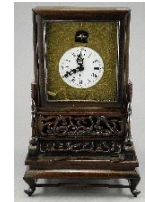
Lot # 429