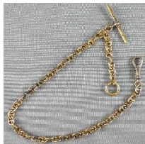
Lot # 491