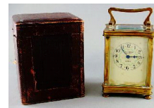
Lot # 410