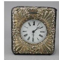
Lot # 413