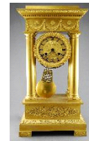
Lot # 427