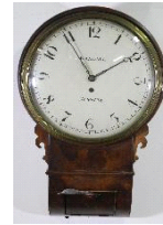
Lot # 408