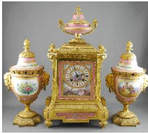
Lot # 401