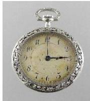
Lot # 489