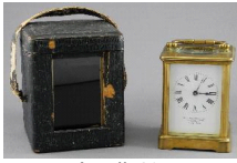
Lot # 415