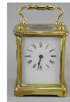
Lot # 414