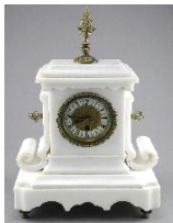
Lot # 418