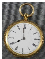
Lot # 478