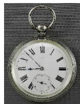
Lot # 474