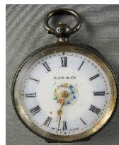
Lot # 479