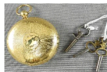
Lot # 480