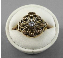
Lot # 488