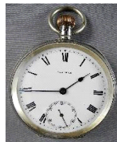
Lot # 477