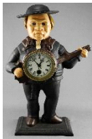
Lot # 421