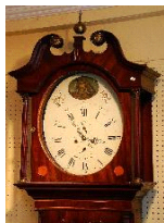
Lot # 403