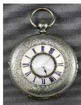
Lot # 473