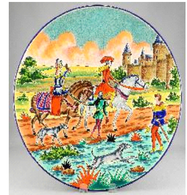
Lot # 464