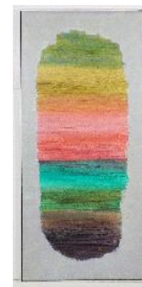
Lot # 662