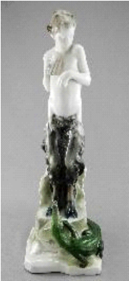
Lot # 700