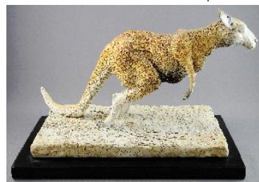
Lot # 678

678 Clay model of a Kangaroo signed G. Rock, 14".