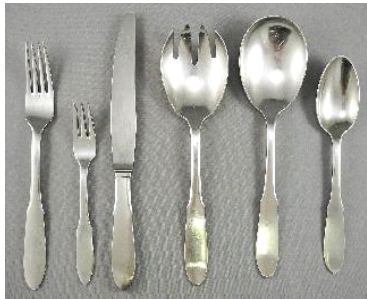
Lot # 401