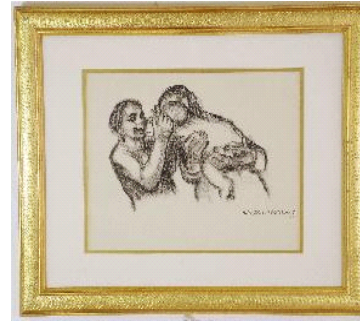
Lot # 680

680 Two prints after Kathe Kollwitz, "Maternal Happiness" and "Visit to the Children's".