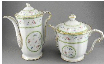
Lot # 582