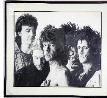
Lot # 428