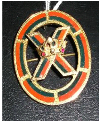
Lot # 480

480 19th century Scottish gold and agate pendant brooch.