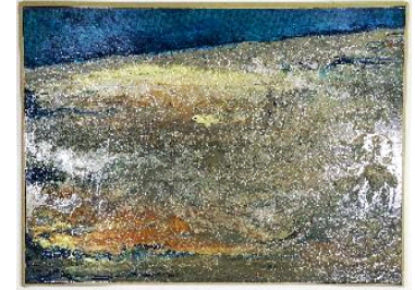
Lot # 460