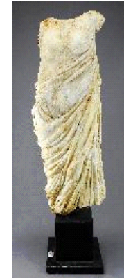
Lot # 684