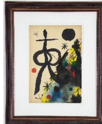
Lot # 682