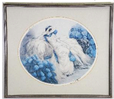
Lot # 669

669 Early 1900's framed print signed Louis Icart, "Reclining Women".