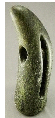
Lot # 512

512 Carved soapstone standing figure- possibly African, height 16 in.