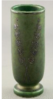
Lot # 696