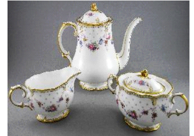
Lot # 609