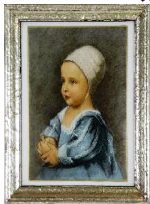
Lot # 623

623 Rosenthal framed porcelain plaque-"Baby Stuart" after Anton van Dyck, 7 1/2 in. x 5 3/4 in.