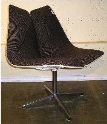
Lot # 455