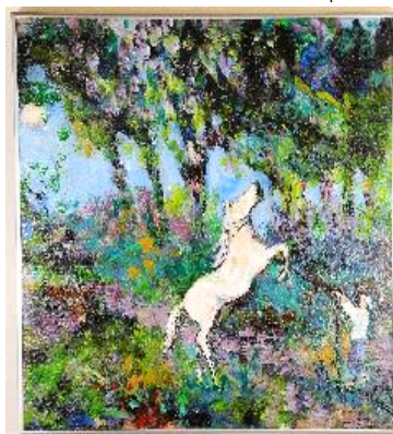
Lot # 528