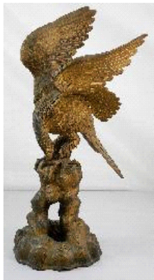
Lot # 666

666 Cast metal eagle on a metal base, height 23 inches.