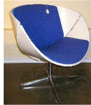
Lot # 456