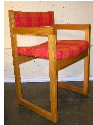
Lot # 457