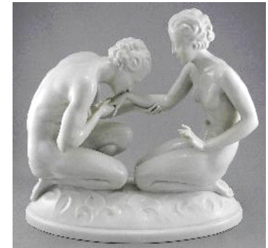
Lot # 688

688 Austrian china figure group- Hand Kiss, length 13 in.