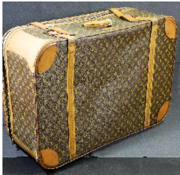
Lot # 578