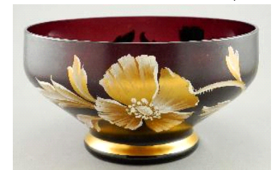
Lot # 445