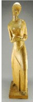
Lot # 466

466 Carved wooden figure of a standing woman holding a bowl.