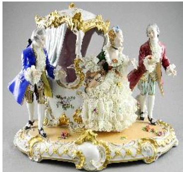
Lot # 694