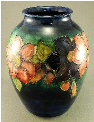
Lot # 693