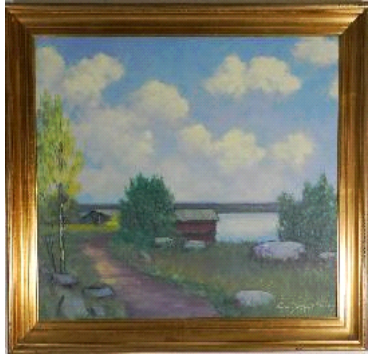
Lot # 580