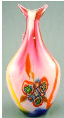
Lot # 558

558 Murano art glass vase, height 11 3/4 in.