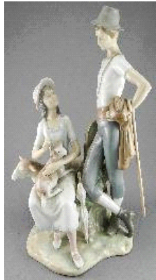
Lot # 461

461 Lladro porcelain figure group- Shepard and Girl with Lambs, height 15 in.