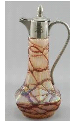
Lot # 752

752 Loetz art glass pitcher with plated top and handle dated 1879-1904, height 8 1/2 in.