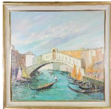
Lot # 743

743 Oil on canvas signed A.Buza, 27 in. x 31 in., "Rialto Bridge, Venice".