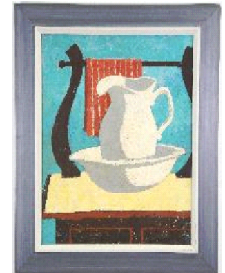
Lot # 576