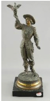
Lot # 767

767 19th century spelter figure of a man with falcon, ht. 13 1/2".