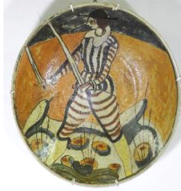
Lot # 773

773 Picasso style art pottery bowl, diameter 13 1/2 inches.