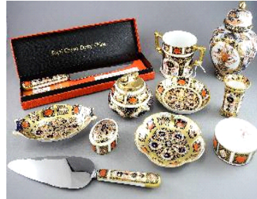
Lot # 738

738 Lot of Royal Crown Derby Imari 1128 pattern china.