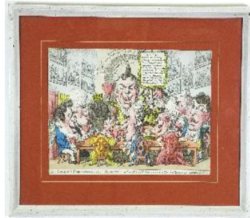
Lot # 589