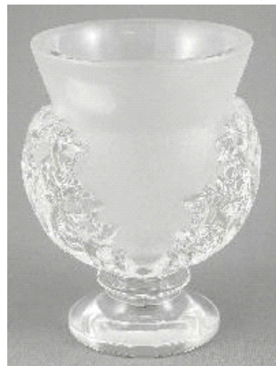
Lot # 563

563 French crystal vase signed Lalique, height 4 1/2 in.