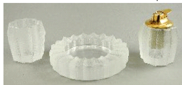
Lot # 560

560 Three piece French crystal smoking set signed Lalique-France.