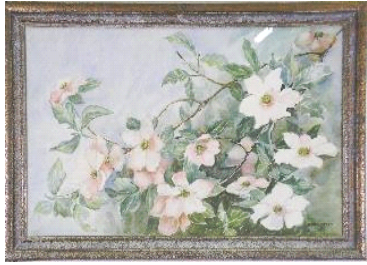
Lot # 765

765 Watercolour signed Isabel Hobbs, 18" x 30", "Stillife".