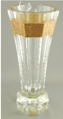
Lot # 625