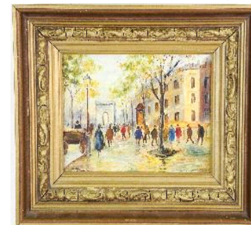
Lot # 668