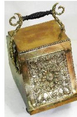
Lot # 786