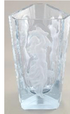
Lot # 568