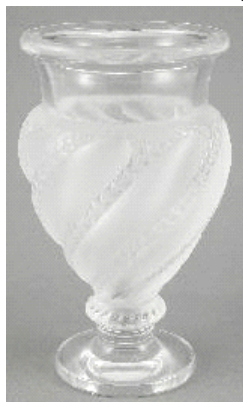
Lot # 559

559 French crystal vase signed Lalique, height 5 3/4 in.