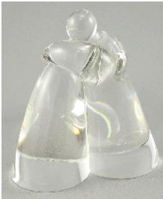
Lot # 405