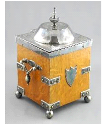
Lot # 790