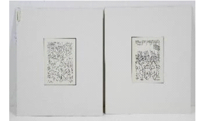
Lot # 616