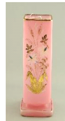
Lot # 669

669 Late Victorian pink floral painted square shaped vase, height 10 3/4 in.