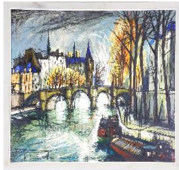
Lot # 689