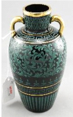
Lot # 460

460 Black glass vase gilded and decorated with enamels.