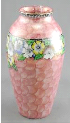
Lot # 675