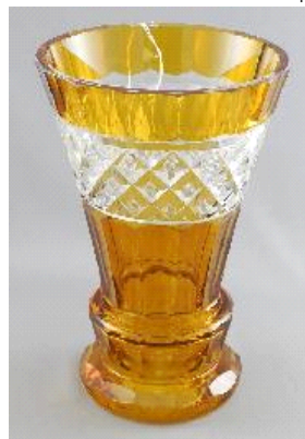
Lot # 564

564 Bohemian amber cut crystal vase, height 8 1/2 inches.