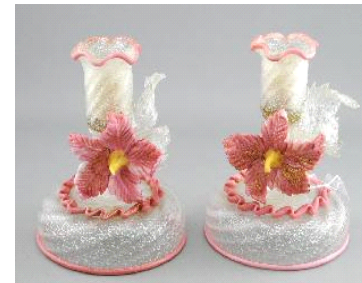
Lot # 569