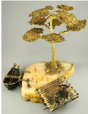
Lot # 506