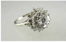
Lot # 426