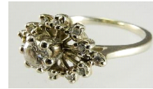
Lot # 622