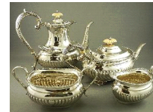
Lot # 459