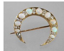
Lot # 425