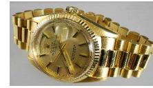
Lot # 502