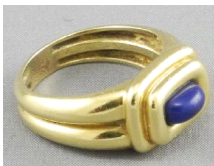
Lot # 464