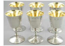
Lot # 434