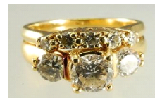
Lot # 630