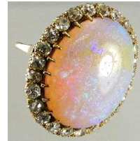
Lot # 424