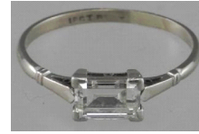
Lot # 421