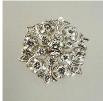
Lot # 427