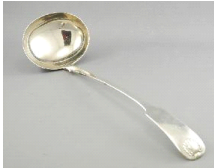
Lot # 408