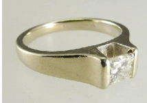
Lot # 445