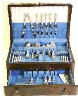
Lot # 655