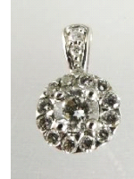
Lot # 661