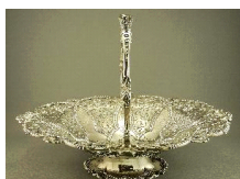
Lot # 511