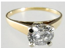
Lot # 430A