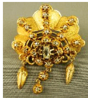
Lot # 468