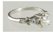
Lot # 441