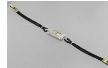
Lot # 504