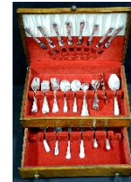
Lot # 455