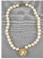
Lot # 444