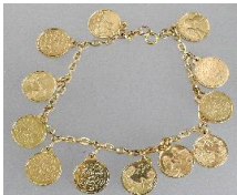
Lot # 466