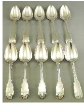
Lot # 402