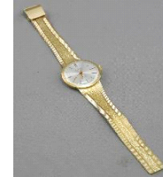
Lot # 503