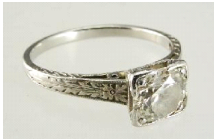
Lot # 428