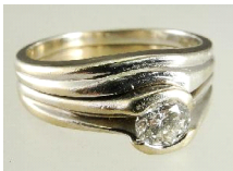
Lot # 463