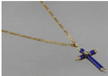
Lot # 467