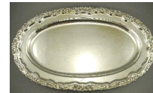
Lot # 458