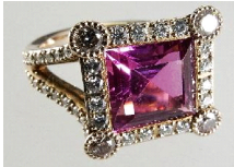
Lot # 489