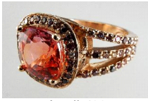
Lot # 488