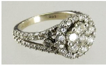
Lot # 429