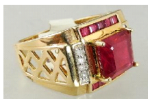
Lot # 563