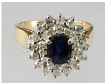
Lot # 430