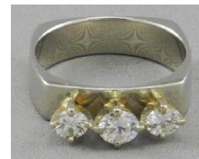
Lot # 443