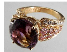
Lot # 487