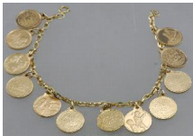
Lot # 466