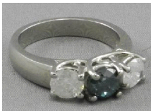
Lot # 448