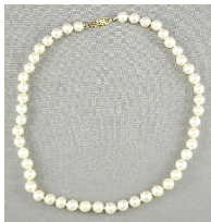
Lot # 446