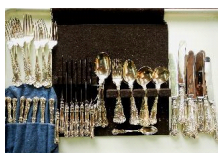
Lot # 512