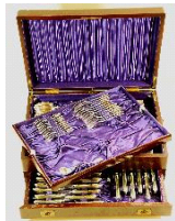
Lot # 611