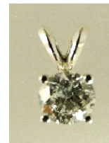
Lot # 618