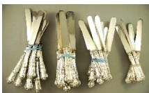
Lot # 469