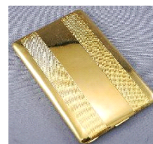
Lot # 727