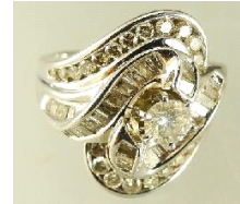
Lot # 418