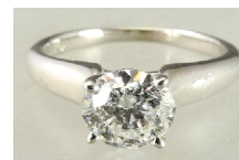
Lot # 457