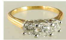
Lot # 499