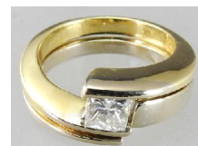
Lot # 577