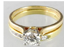
Lot # 511