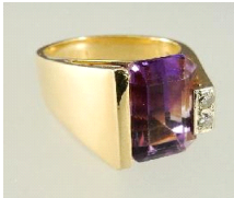
Lot # 515