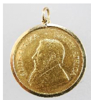
Lot # 721