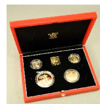
Lot # 730