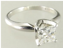
Lot # 492