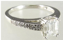
Lot # 491