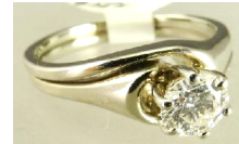
Lot # 534