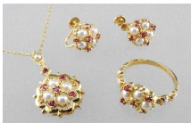
Lot # 495