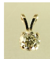
Lot # 619