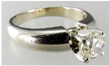
Lot # 459