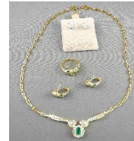
Lot # 473