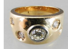
Lot # 413