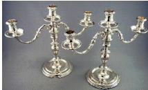
Lot # 402