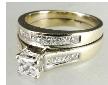
Lot # 538