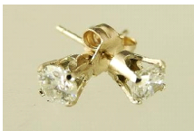
Lot # 591