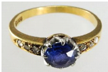
Lot # 518