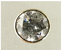
Lot # 520