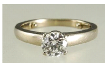
Lot # 560