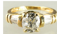
Lot # 513