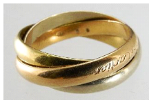
Lot # 432