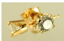
Lot # 556