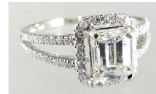
Lot # 475