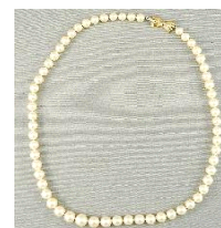
Lot # 653