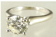
Lot # 493