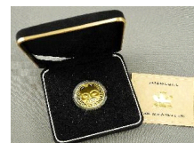
Lot # 729