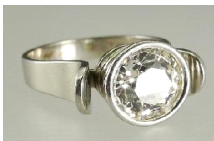
Lot # 411