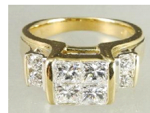
Lot # 480