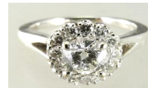
Lot # 456