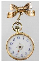
Lot # 483

483 18k yellow gold cased ladies pocket watch W/9ct. bow brooch.