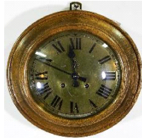
Lot # 418