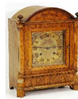
Lot # 507

507 Oak bracket style clock with brass dial.