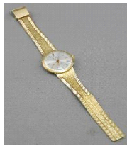
Lot # 525

524 Two transitional cased wrist watches $20 - $30