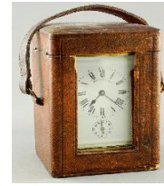
Lot # 447