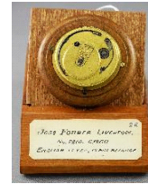
Lot # 438

438 Watch Movement: Josa. Forber, Liverpool.