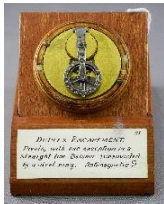
Lot # 434