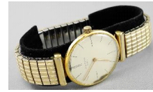
Lot # 409