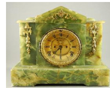
Lot # 413