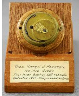
Lot # 442