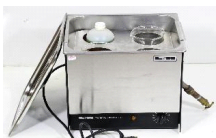
Lot # 468