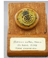
Lot # 429