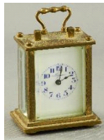
Lot # 405