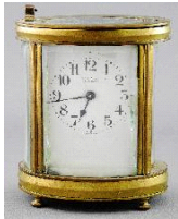
Lot # 444