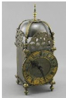
Lot # 445