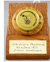
Lot # 426