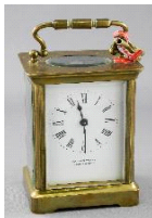
Lot # 446