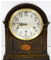
Lot # 461