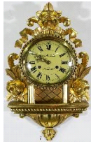
Lot # 417