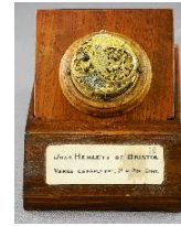
Lot # 440