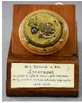
Lot # 441