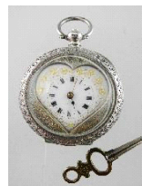
Lot # 473