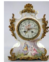
Lot # 415