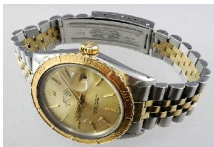
Lot # 404