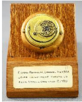
Lot # 435

435 Watch Movement: Thomas Reynolds, London.