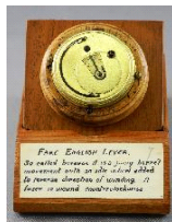
Lot # 425