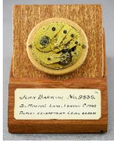
Lot # 432