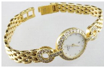
Lot # 402