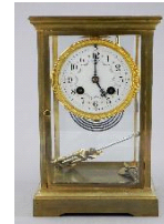
Lot # 449