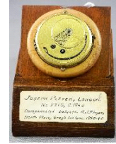
Lot # 437

437 Watch Movement: Joseph Player, London.