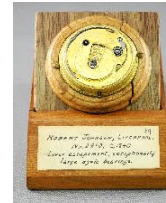
Lot # 430