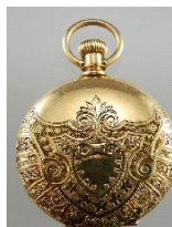
Lot # 474