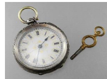
Lot # 478