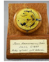
Lot # 436