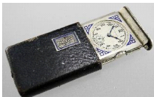
Lot # 472