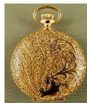
Lot # 475