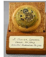
Lot # 439