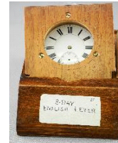
Lot # 428