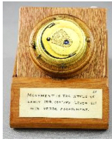
Lot # 431