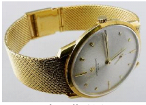
Lot # 401