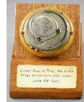
Lot # 427