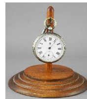
Lot # 479