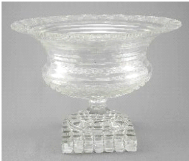
Lot # 272

271 Staffordshire figure-Seated Man with Keg "Will Watch", height 13 1/2 in. $50 - $75