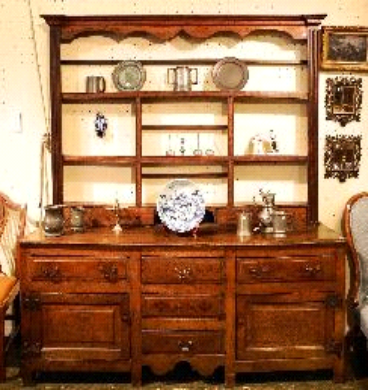
Lot # 205