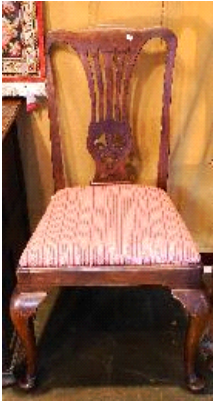
Lot # 144