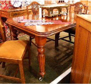
Lot # 211