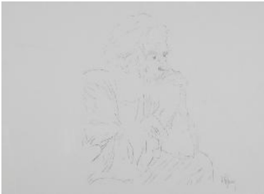
Lot # 83

83 Drawing signed Myfanwy(Pavelic), 14 in. x 21 in., "Nikki Pavelic".