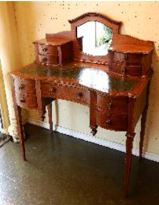
Lot # 108

104 Oval gilt framed mirror. $100 - $200 105 Oil on board signed J. Duncan, 8" x 10", "Spring Mountain Landscape". $25 - $50 106 Watercolour dated 1925, 5" x 7", "Tropical View". $25 - $50 107 Small brass figure of Buddha on lotus. $25 - $50