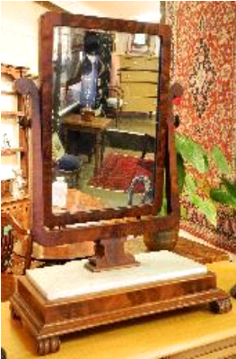
Lot # 228

221 Oil on board signed Victor Lotto 12in. x 16in., "Pink Lake". $50 - $75 222 Inuit soapstone carving-hunter with fish, Laso Hak. $75 - $150 223 Nest of 19th century mahogany tables. $100 - $200 224 Pastel signed B.de la G., 20 in. x 27 in., "Valpantera". $75 - $125 225 Oil on masonite signed Barry Burdeny, 20" x 30", "Winter Landscape". $30 - $60 226 Victorian mahogany upholstered parlour chair. $150 - $200 227 Pair of 19th century ladder back chairs. $200 - $300