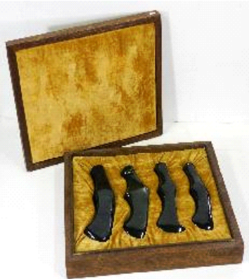
Lot # 179

179 Cased set of four jade axe heads. $500 - $700