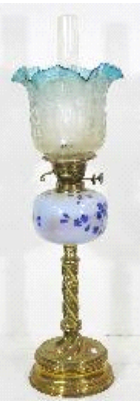
Lot # 242

242 Victorian brass decorated blue glass oil lamp.