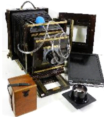
Lot # 6