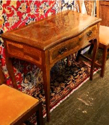
Lot # 216

215 Chinese imari pattern charger. $150 - $250