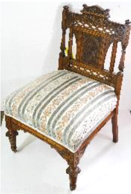
Lot # 163

162 Inlaid mahogany tilt-top pedestal table. $100 - $150