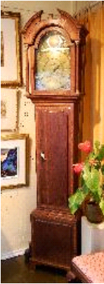
Lot # 260