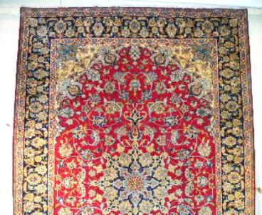
Lot # 194