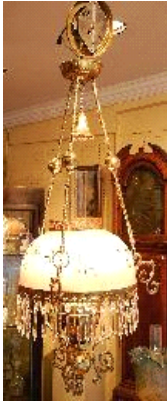
Lot # 285

285 Victorian hanging light fixture with hand painted shade and glass drops.