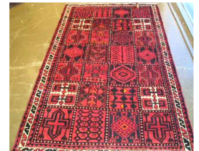
Lot # 283