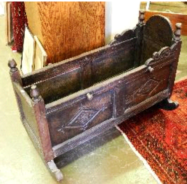
Lot # 30

29 Pair of French 19th. century coloured prints, "Cienne Moeris". $20 - $30