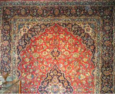
Lot # 214