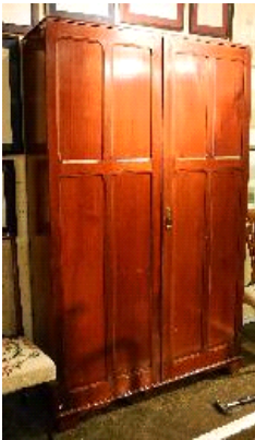
Lot # 90