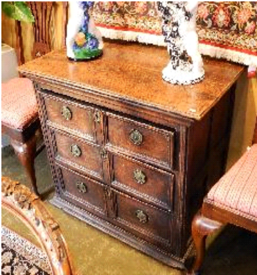
Lot # 156

155 Pair of Victorian decorated lacquered hand screens, length 15 inches. $50 - $75