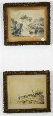
Lot # 262