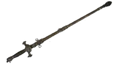
Lot # 282