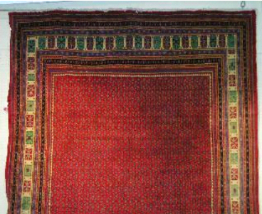
Lot # 56