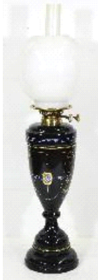
Lot # 153

152 Watercolour signed Dimsie dated November 1904, "Reading by Falls". $20 - $40