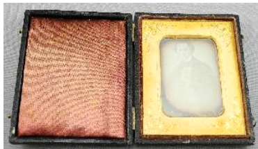
Lot # 4