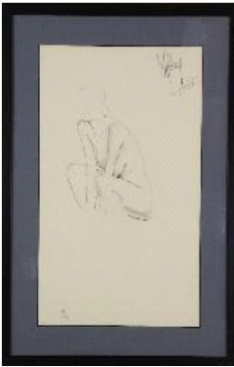
Lot # 81