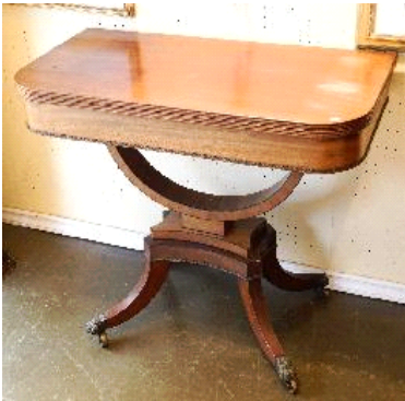
Lot # 265

264 Pair of Victorian brass candlesticks $25 - $50