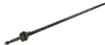
Lot # 281