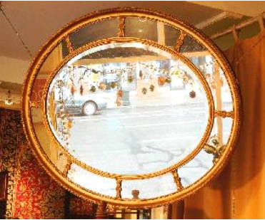
Lot # 104

99 Carved mirrored back cabinet with display side. $250 - $500 100 Lot with ivory dresser set and a prayer book. $25 - $50 101 Lot with misc. serving pieces, flatware, etc. $20 - $40 102 Watercolour signed Janiek Ledezle, 12 1/2 in. x 18 1/2 in., "Harbour Scene". $40 - $60 103 Watercolour signed E. Parkman, 4 1/4"x10 1/4", "European Street Scene". $75 - $150