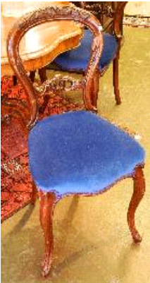
Lot # 231

231 Set of four Victorian balloon back chairs.