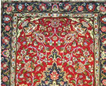
Lot # 159

158 Victorian rosewood Canterbury. $300 - $500