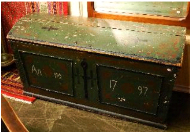
Lot # 48