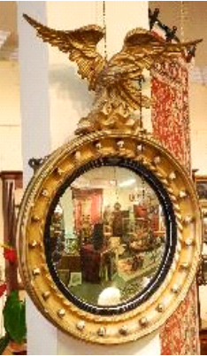
Lot # 151