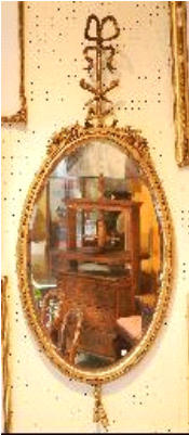
Lot # 261