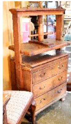
Lot # 287

287 18th century oak linen press with three drawers.