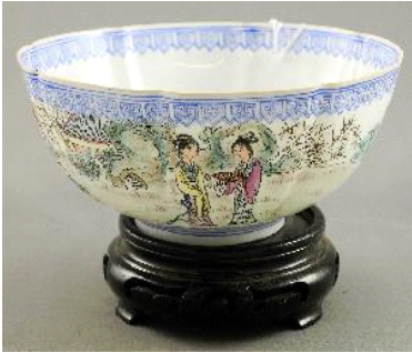
Lot # 188