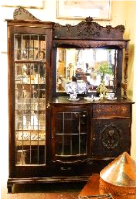
Lot # 99

96 Watercolour signed W.H.Welch, "Harvest Scene". $50 - $100 97 Small brass seated Buddha on three elephants, height 8 1/2 in. $50 - $75 98 Royal Crown Derby "Mikado" tea set. $50 - $75