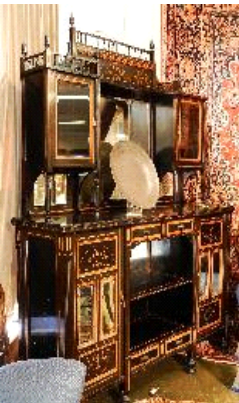
Lot # 217

216 Louis XV style parquetry inlaid kingwood side table. $200 - $400