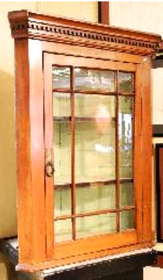
Lot # 91

91 19th. century mahogany hanging corner cabinet.