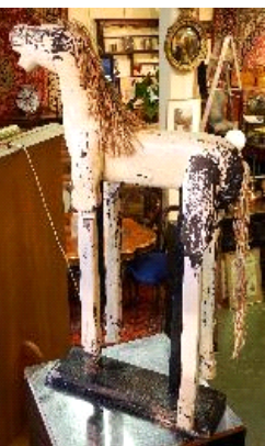
Lot # 36

35 Parquet inlaid top side table. $50 - $100