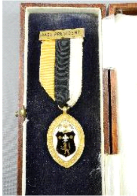
Lot # 1