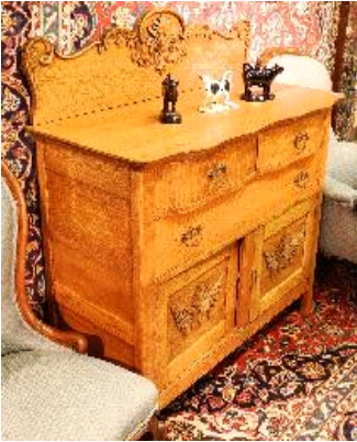
Lot # 192