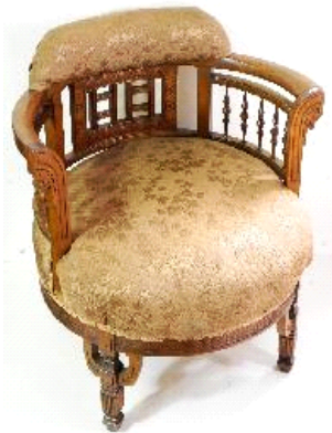
Lot # 184