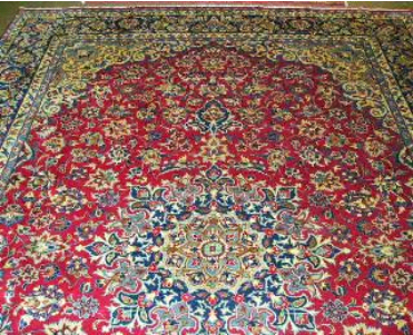
Lot # 150