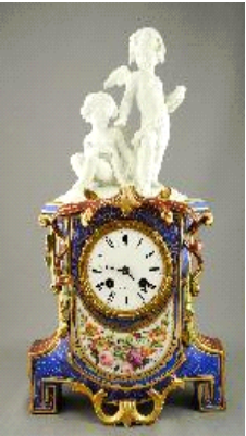
Lot # 263