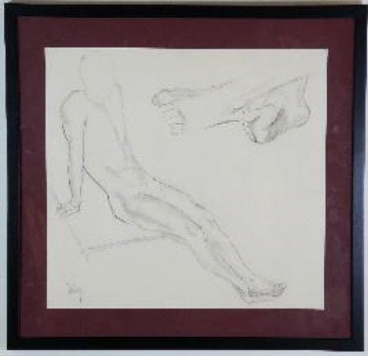
Lot # 80