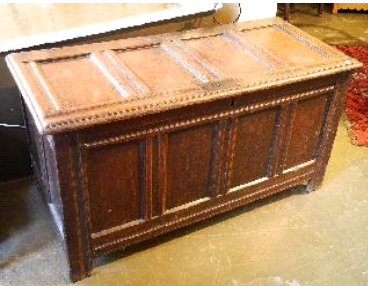
Lot # 239