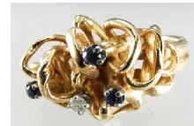
Lot # 500