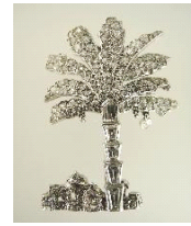
Lot # 411