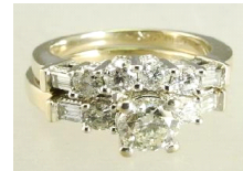
Lot # 432