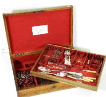
Lot # 461