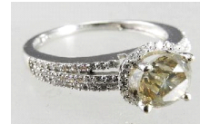
Lot # 431