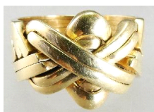
Lot # 563