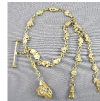
Lot # 546