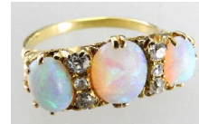
Lot # 451