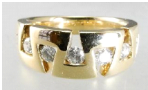
Lot # 457