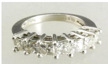
Lot # 420