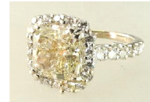
Lot # 412