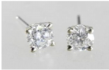
Lot # 436