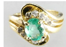
Lot # 454