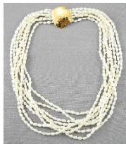
Lot # 438