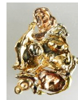
Lot # 473