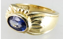
Lot # 515