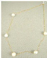
Lot # 439