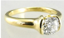
Lot # 417