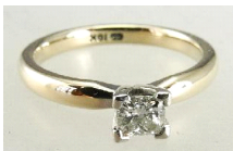
Lot # 440