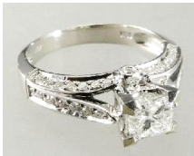
Lot # 458