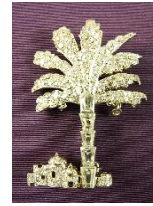
Lot # 411