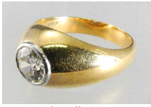
Lot # 416