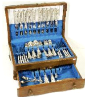
Lot # 481