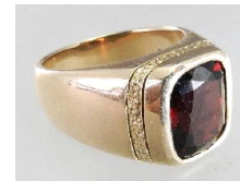
Lot # 474