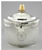
Lot # 484