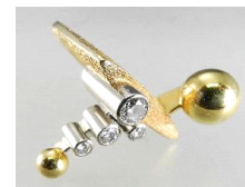
Lot # 415