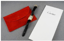
Lot # 403