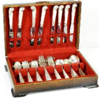
Lot # 643