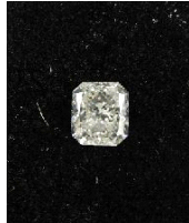
Lot # 418