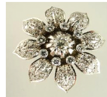
Lot # 452