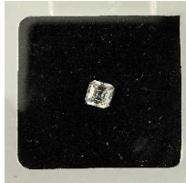
Lot # 456