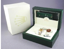
Lot # 402