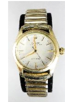
Lot # 712