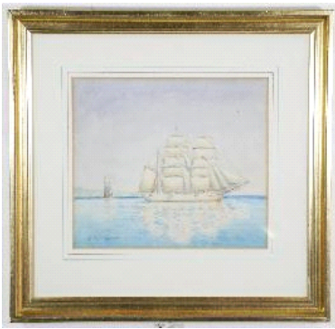
Lot # 78