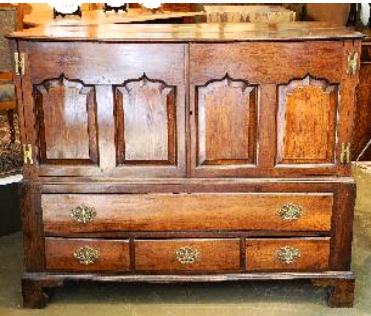
Lot # 208