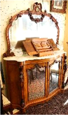
Lot # 255

255 Early Victorian burl walnut mirrored backed side credenza. $400 - $600