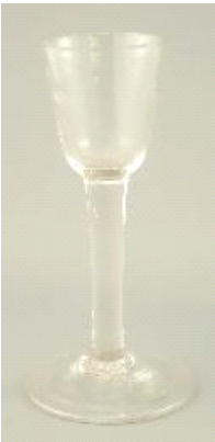
Lot # 169