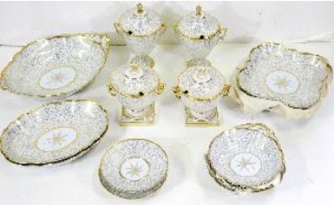
Lot # 252

251 Dutch classical style 12 branch chandelier. $200 - $300