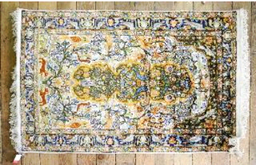
Lot # 199