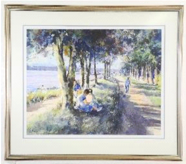
Lot # 206