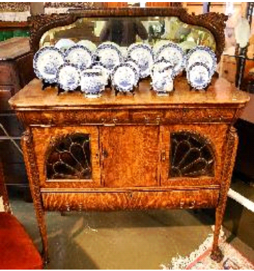
Lot # 149