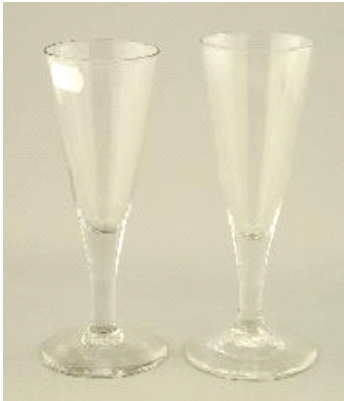
Lot # 160

159 German china gilt decorated covered bowl with bee hive mark, height 5". $50 - $75