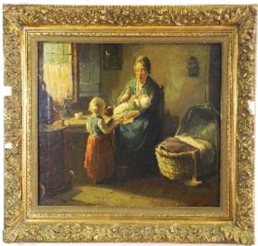
Lot # 243

242 Early Victorian carved rosewood upholstered chaise longue. $300 - $500