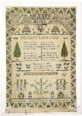
Lot # 207