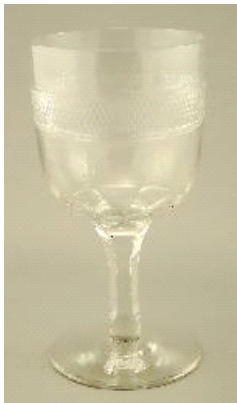
Lot # 236

235 Early 19th century Irish stem glass.