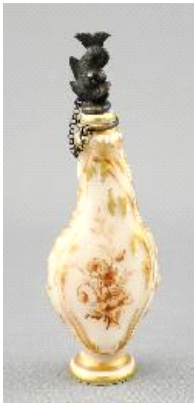
Lot # 143