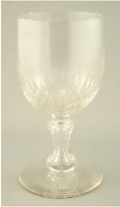
Lot # 233