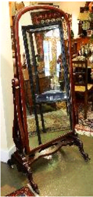
Lot # 146