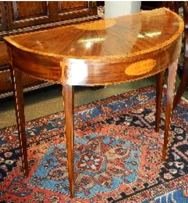
Lot # 210