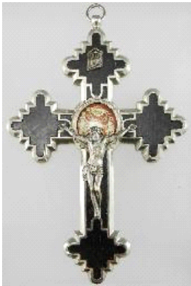
Lot # 140