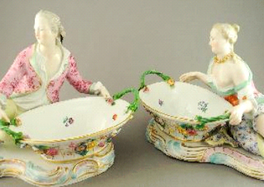
Lot # 257

256 19th century ebonized side cabinet. $400 - $600