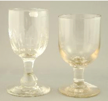
Lot # 90

89 Pair of oils on board signed M.F.K., 7" x 10", "Evening", "Pelican Lake". $50 - $100