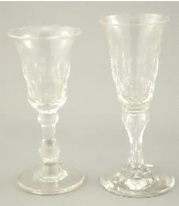
Lot # 181

181 Two early 19th century stem glasses. $50 - $100