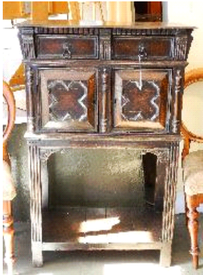
Lot # 214

213 Pair of Victorian mahogany balloon back side chairs. $100 - $150