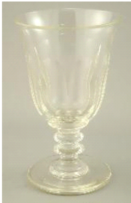
Lot # 235

235 Early 19th century Irish stem glass.