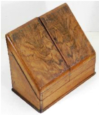
Lot # 225