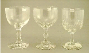
Lot # 247

246 Victorian burl oak writing box. $75 - $125