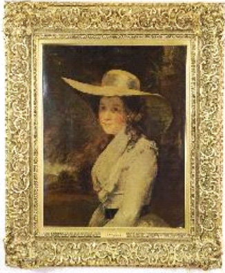
Lot # 240

76 Victorian carved walnut upholstered rocker. $50 - $75