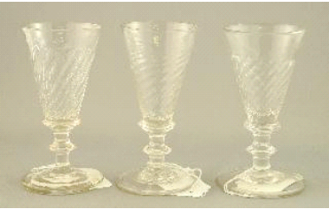
Lot # 176

175 Oil on canvas indistinctly signed and dated '64, 17" x 27", "Coastal Landscape". $30 - $60