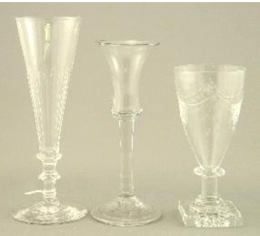
Lot # 166

165 European floral painted china covered bowl- marked "R". $15 - $30