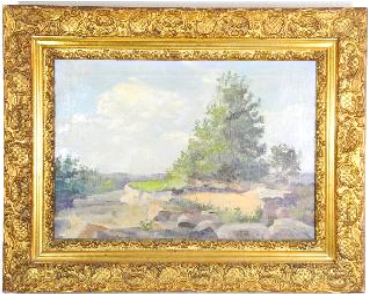
Lot # 227