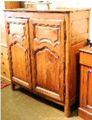
Lot # 108