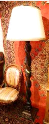
Lot # 114