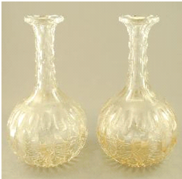
Lot # 238