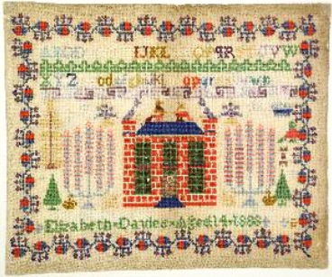
Lot # 59

58 Set of twelve oak dining chairs with label- Hampshire & Lee, Muddersfield. $400 - $600