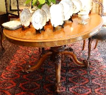
Lot # 253

252 Flight Barr & Barr Worcester china part dinnerware service. $400 - $600