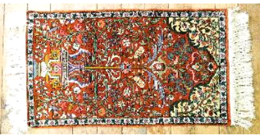
Lot # 60