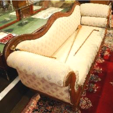
Lot # 129