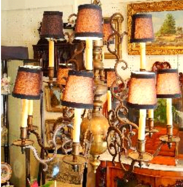
Lot # 251

250 Pakistani Boukara carpet. $400 - $600