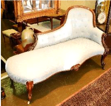
Lot # 242

241 19th century Belgian carved framed mirror. $150 - $250