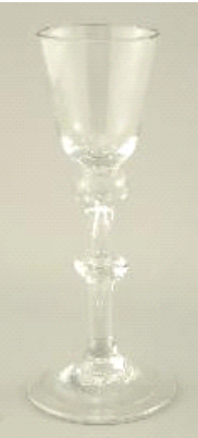
Lot # 170