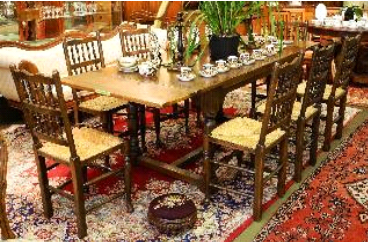
Lot # 136

136 Oak draw leaf dining room table with a set of eight rush seated chairs. $300 - $500