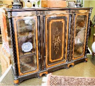
Lot # 256

255 Early Victorian burl walnut mirrored backed side credenza. $400 - $600