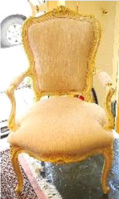
Lot # 215

214 Jacobean style carved oak cabinet fitted with two drawers over cabinet base. $200 - $300