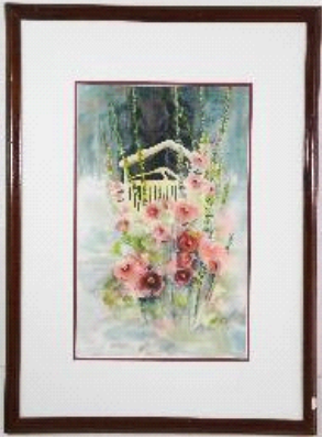
Lot # 185