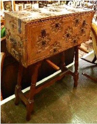
Lot # 112