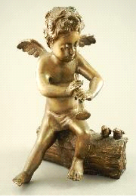
Lot # 48

47 Oil on canvas signed G.Kotzbeck, 13" x 9 1/4", Road to Monastery". $25 - $50