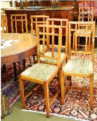
Lot # 58

57 19th century carved mahogany sideboard. $200 - $400