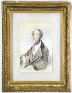
Lot # 147