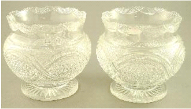
Lot # 224