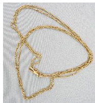
Lot # 463

462 Air plane motif mantel clock. $25 - $50