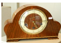
Lot # 439