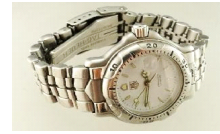
Lot # 424