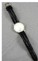
Lot # 465

464 Lady's 14K white gold Rolex wristwatch with 14K fox link bracelet. $600 - $800