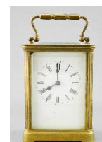
Lot # 447