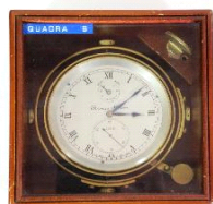
Lot # 441