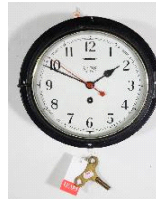
Lot # 410