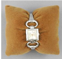
Lot # 402