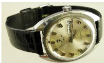
Lot # 406