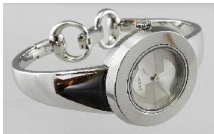
Lot # 404