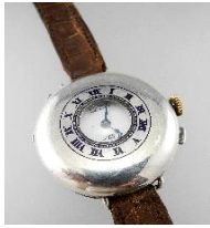
Lot # 475