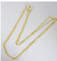
Lot # 480