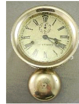
Lot # 408