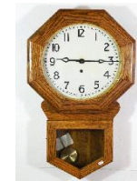
Lot # 411