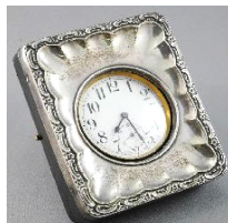
Lot # 466

466 Travel clock in a hallmarked silver mounted case, size of case 4 3/4" x 3 3/4". $100 - $150