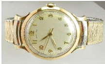
Lot # 477