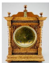
Lot # 437