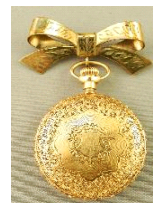
Lot # 468

467 A.W.W.G. Waltham railroad pocket watch, c.1883. $400 - $600