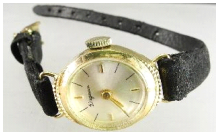
Lot # 478