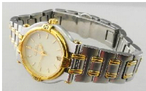
Lot # 403