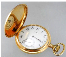
Lot # 479