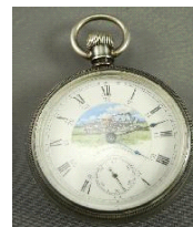
Lot # 467

466 Travel clock in a hallmarked silver mounted case, size of case 4 3/4" x 3 3/4". $100 - $150