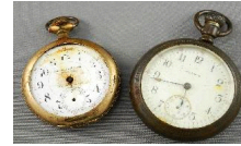
Lot # 425