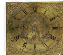
Lot # 427