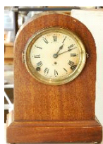
Lot # 438