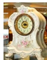
Lot # 446