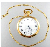
Lot # 442