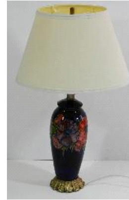
Lot # 659