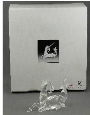
Lot # 586