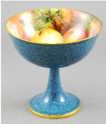
Lot # 576

575 Rosenthal hand painted china brooch. $40 - $60