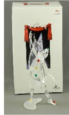
Lot # 583

582 Swarovski 2000 figure in box- Masquerade-Columbine with label. $75 - $150