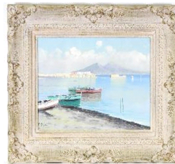
Lot # 645