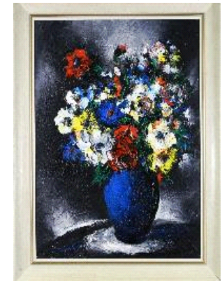
Lot # 437

437 Oil on canvas indistinctly signed, 26" x 20", "Stilllife".