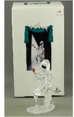
Lot # 584

583 Swarovski 1999 figure in box- Masquerade Perrot with label. $75 - $150