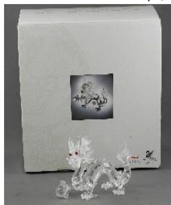
Lot # 587