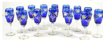
Lot # 638