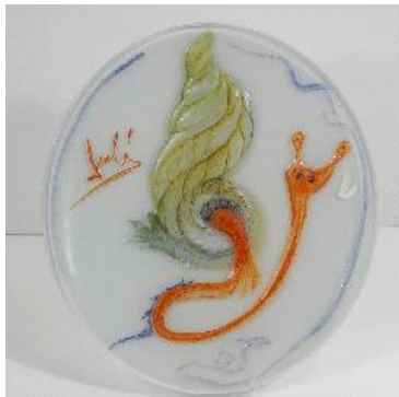
Lot # 625