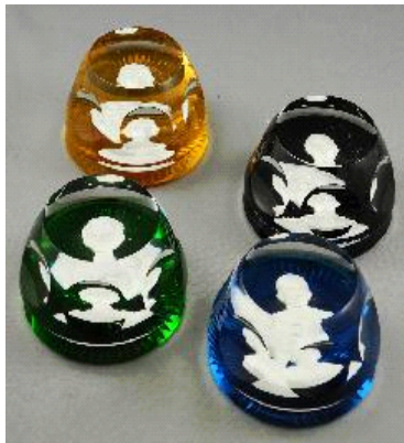
Lot # 406