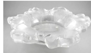
Lot # 660