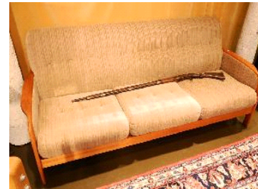
Lot # 465