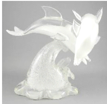
Lot # 489