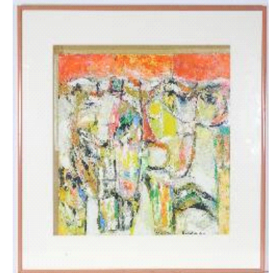
Lot # 467