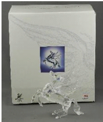
Lot # 585