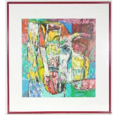
Lot # 436

436 Acrylic on canvas indistinctly signed, 15" x 15", "Abstract Horse".