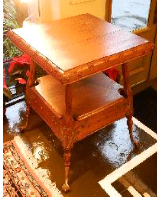
Lot # 657