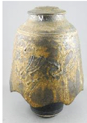
Lot # 462