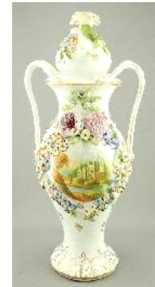
Lot # 651