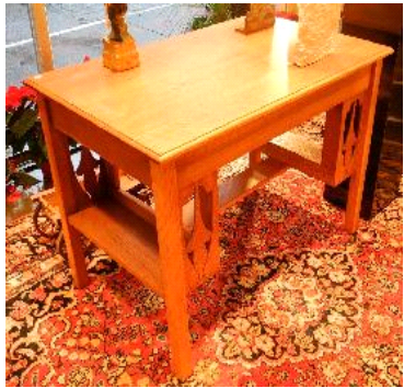
Lot # 655