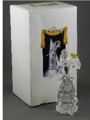
Lot # 582

582 Swarovski 2000 figure in box- Masquerade-Columbine with label. $75 - $150