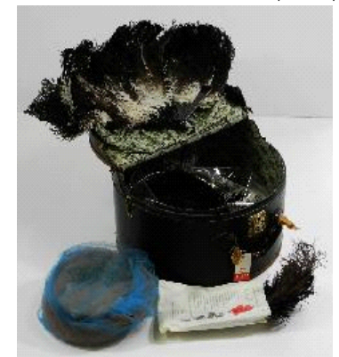
Lot # 518