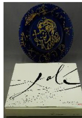
Lot # 551