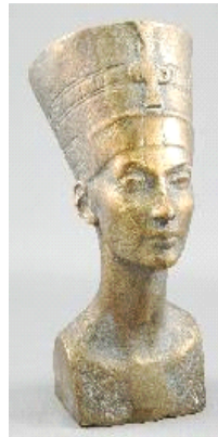
Lot # 414