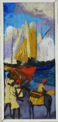
Lot # 623