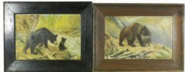
Lot # 224