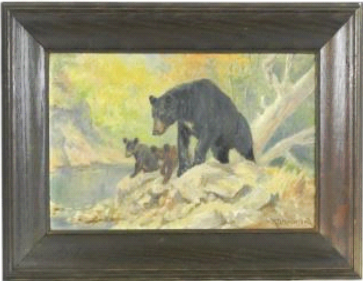
Lot # 265

264 Oil on board signed N. Drummond, 9" x 14 1/2", "Bull Elk". $100 - $200