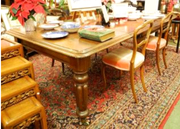
Lot # 60