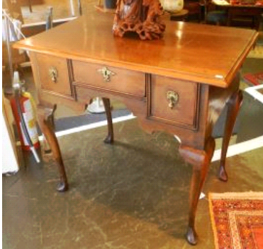
Lot # 251