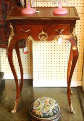
Lot # 254