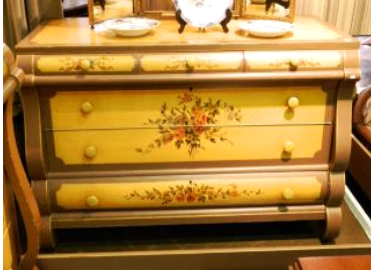
Lot # 31

30 19th century painted chest of drawers. $200 - $300