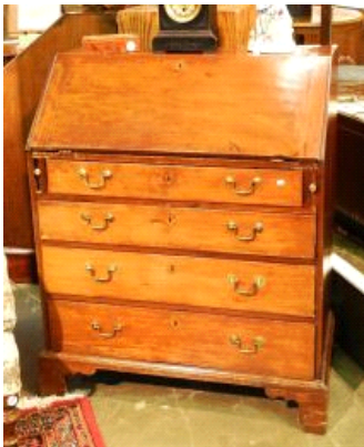
Lot # 188