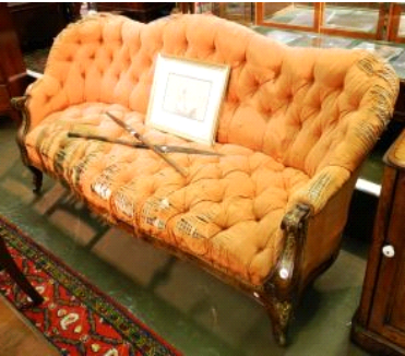
Lot # 159