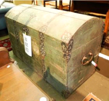
Lot # 49