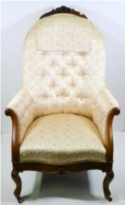
Lot # 54