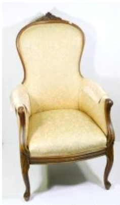
Lot # 73