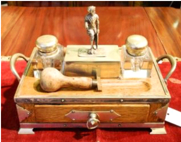
Lot # 219