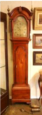
Lot # 266

265 Oil on board signed N. Drummond, 9" x 14 1/2", "Mother Bear with Two Cubs". $100 - $200