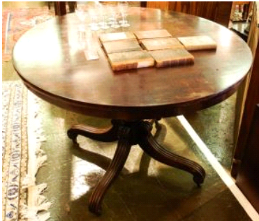
Lot # 199