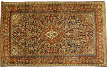
Lot # 267