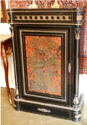
Lot # 261

260 Pair of 19th. century brass candlesticks. $25 - $50