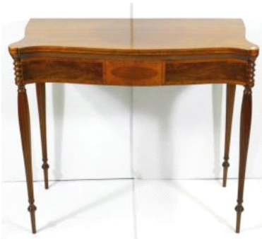
Lot # 202