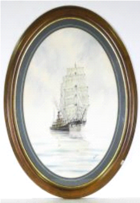
Lot # 211