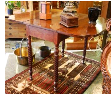
Lot # 237