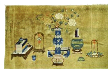
Lot # 230