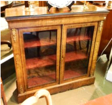
Lot # 218