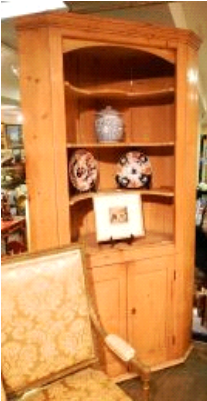
Lot # 101