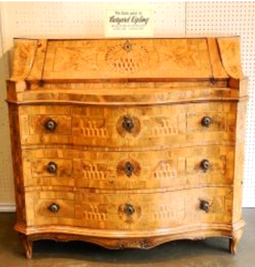
Lot # 268