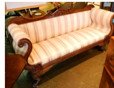
Lot # 243