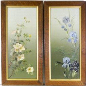
Lot # 52