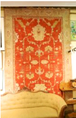
Lot # 10A