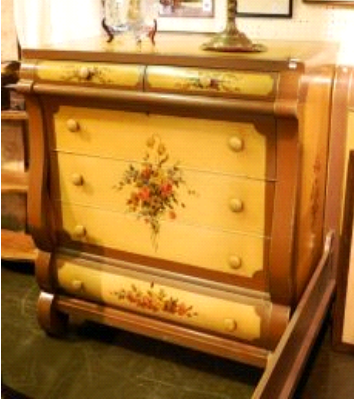
Lot # 30

29 Etching signed Caroline H. Armington 11/100, 11" x 7", "L'Eglise St. Maclou a Rouen". $75 - $100