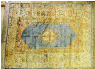
Lot # 222