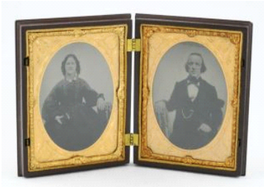
Lot # 247