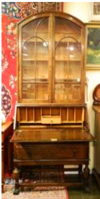
Lot # 119