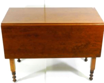
Lot # 21

20 Lot of Queen Victoria 1887 jubilee commemorative china. $25 - $50