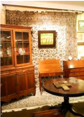
Lot # 200