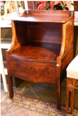
Lot # 214