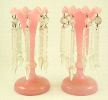
Lot # 255