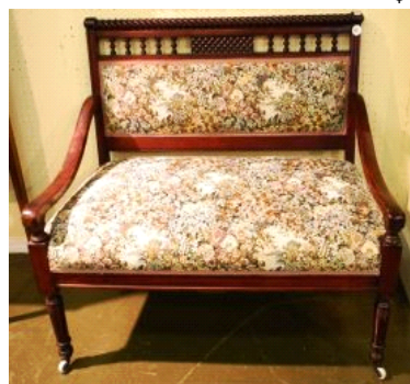
Lot # 91