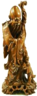
Lot # 250