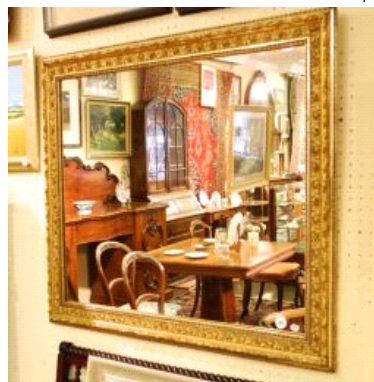
Lot # 90