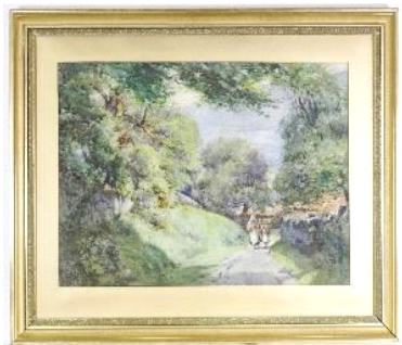
Lot # 112