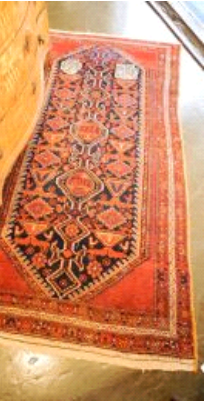
Lot # 252