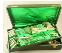
Lot # 466