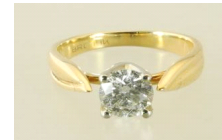
Lot # 435