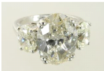
Lot # 411