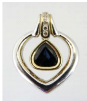
Lot # 454