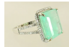
Lot # 437