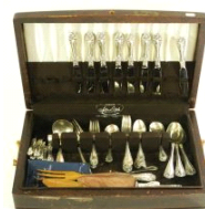
Lot # 490