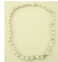
Lot # 436