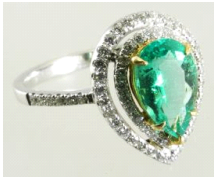
Lot # 439