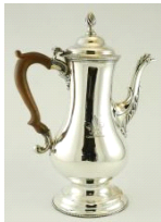
Lot # 441