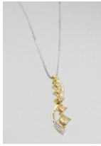
Lot # 452