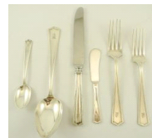
Lot # 450