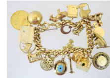
Lot # 434