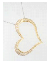
Lot # 493