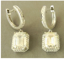
Lot # 420