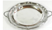
Lot # 463