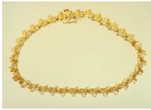
Lot # 495