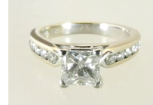
Lot # 415