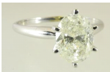
Lot # 432