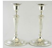
Lot # 465