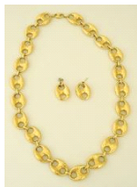
Lot # 456