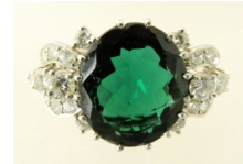
Lot # 416