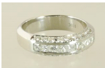
Lot # 455