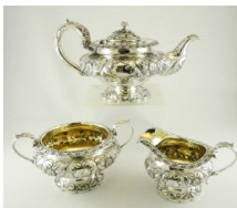
Lot # 444