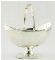
Lot # 443