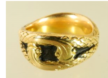
Lot # 531