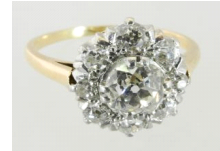
Lot # 420