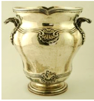
Lot # 401