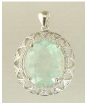
Lot # 448