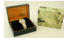
Lot # 461