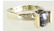
Lot # 441