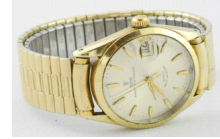
Lot # 565