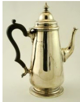
Lot # 403