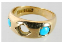
Lot # 484