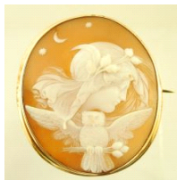
Lot # 483