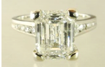
Lot # 415