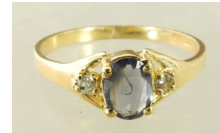
Lot # 419