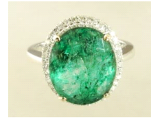
Lot # 418