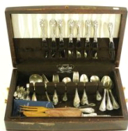
Lot # 409