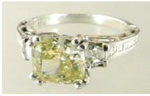
Lot # 411