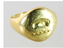
Lot # 487