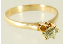
Lot # 425