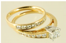
Lot # 417