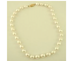
Lot # 423