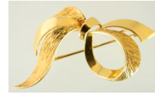
Lot # 526