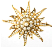
Lot # 510