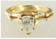
Lot # 424