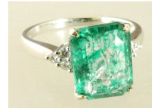
Lot # 438