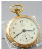
Lot # 592