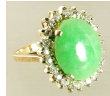
Lot # 421