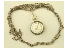
Lot # 464