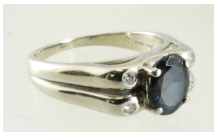
Lot # 436