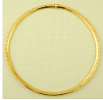
Lot # 445