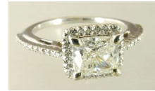
Lot # 439