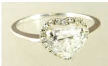
Lot # 437