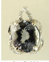
Lot # 444