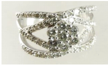
Lot # 505