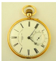
Lot # 591