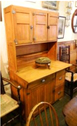
Lot # 41

40 Knit top pedestal stool with dog motif. $10 - $20