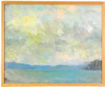
Lot # 194