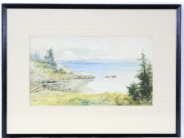
Lot # 169

169 Watercolour signed N. Drummond, "Vancouver Island Coastal Scene".