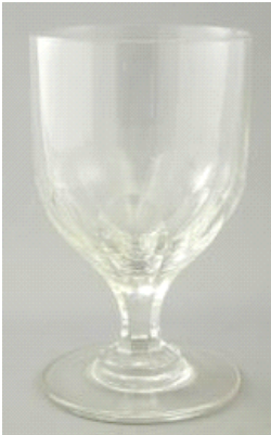
Lot # 238

237 Two-handled porcelain entree dish, in Imari colours. $20 - $40