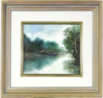
Lot # 218