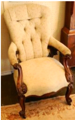
Lot # 267

266 Oil on canvas indistinctly signed, 12" x 16", "Boats at Dock". $40 - $60