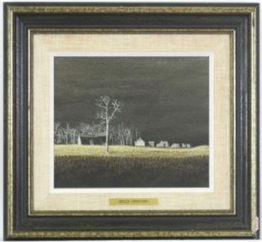
Lot # 133

132 Oil on board signed W.L. Courtney, 9" x 12", "The Shoals - Georgian Bay". $100 - $150