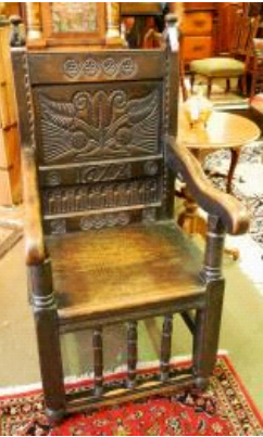
Lot # 222