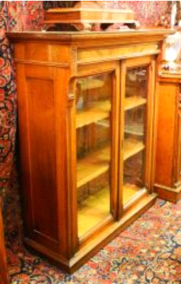
Lot # 137

137 Victorian mahogany bookcase with glazed doors. $150 - $200