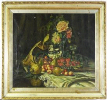
Lot # 22