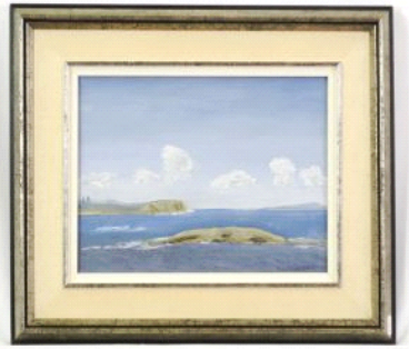
Lot # 132

131 Mixed media on paper signed Lindsay (James), 11" x 7-1/2", "Chrysalis". $100 - $150