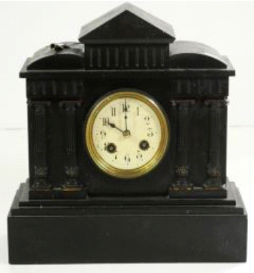
Lot # 97

95 Oil on board signed Charles Poingdestre, 11 1/2" x 8 1/2", "Bridge over Stream". $75 - $150 96 Framed watercolour signed J.S. Pride, "Coastal Scene". $20 - $40