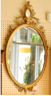
Lot # 258

257 Late 18th-early 19th century cherry wood low boy. $100 - $150