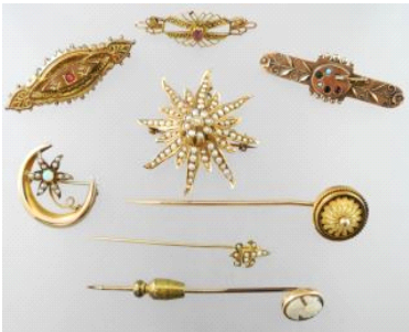
Lot # 1