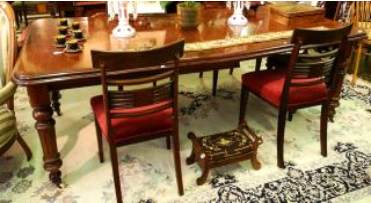
Lot # 170

170 Victorian mahogany dining table with two leaves.