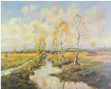
Lot # 272

271 Victorian carved oak parlour table. $50 - $75