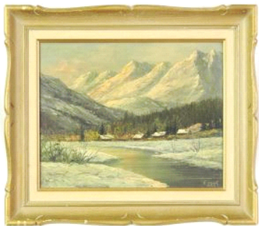
Lot # 47