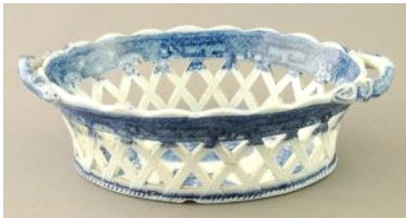
Lot # 277

272 Oil on canvas signed Guillian B. Marizian, "Landscape". $75 - $125 273 Three Edwardian carved walnut Roman revival arm and side chairs. $100 - $200 274 19th. century Continental ale glass with painted hunting design. $50 - $75 275 Georgian carved horn box. $30 - $50 276 Belleek china vase with ruffled rim, diameter 4"(black mark). $15 - $30