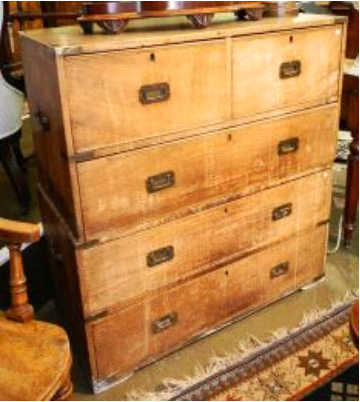
Lot # 221