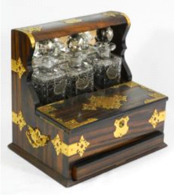
Lot # 256

255 Pair of Victorian brass candlesticks. $20 - $30