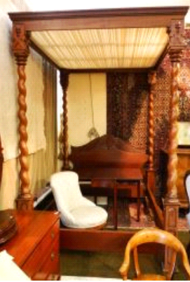
Lot # 210