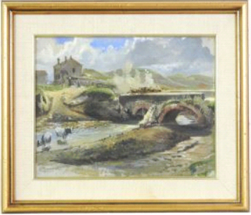
Lot # 95

92 Middle Eastern style area rug. $125 - $175 93 Mahogany fold-over tea table. $100 - $150 94 Victorian mahogany cameo back lady's chair. $75 - $100