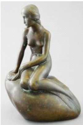
Lot # 279