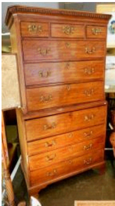
Lot # 282