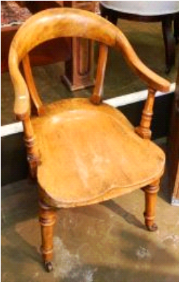
Lot # 216