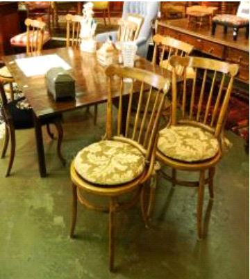
Lot # 161