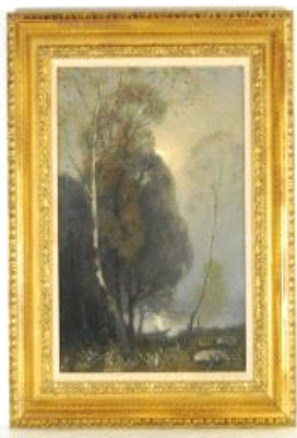
Lot # 259