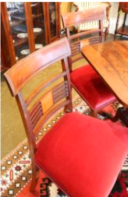
Lot # 178

178 Set of six early Victorian inlaid mahogany square backed dining room chairs.