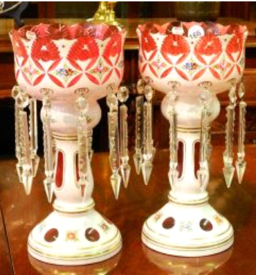
Lot # 166