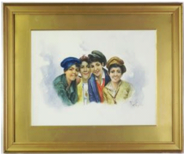
Lot # 268

267 Victorian carved rosewood button backed open armchair. $100 - $150