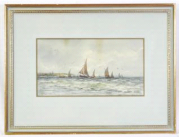
Lot # 261