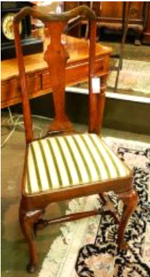
Lot # 188