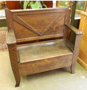
Lot # 66