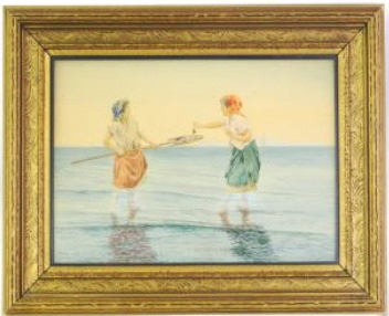
Lot # 262