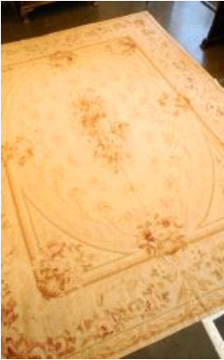
Lot # 253

252 Victorian carved mahogany coffee table. $100 - $200