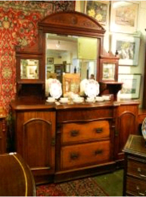
Lot # 193