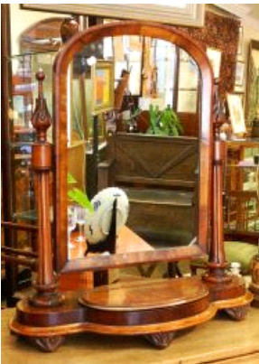
Lot # 219