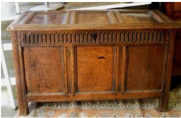
Lot # 232

231 19th century oak long cased clock. $700 - $900