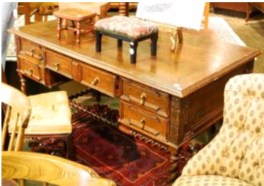
Lot # 152