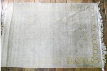
Lot # 213