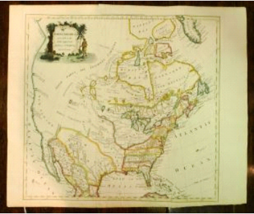
Lot # 159