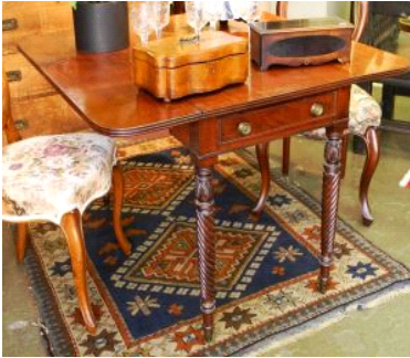
Lot # 228

227 Set of 5 crystal drinking glasses. $60 - $90