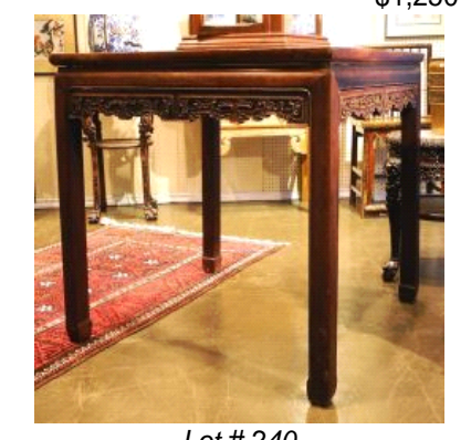
Lot # 240 240 Chinese Ming Dynasty Scholar's Table. $4,000 - $6,000

241 19th Century blue and white charger decorated with birds.