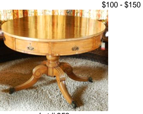
Lot # 258 258 Victorian Mahogany Rent Table, 46" diameter. $200 - $300

257 Early 19th. century mahogany desk top brass with brass mounts and key.