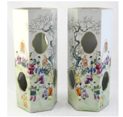
Lot # 281 281 Good pair of 19th C. Qing hat stands decorated with boys playing, 11".