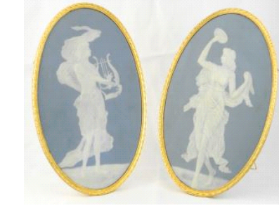
Lot # 287 287 Pr.of Limoges pate-sur-pate plaques- Young Women playing lyre & tambourine, length 10 1/2". $400 - $600