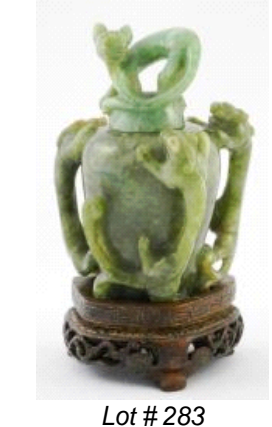
283 Chinese carved jade covered urn on a wooden stand, 3 1/8".