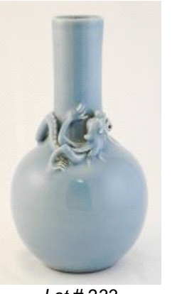
Lot # 233 233 Chinese Qing Claire de lune bottle vase, 9". $500 - $750

Lot # 231 231 19th C. carved walnut sideboard. $500 - $1,000 232 Asian carpet approx. 16' x 11'5". $300 - $600