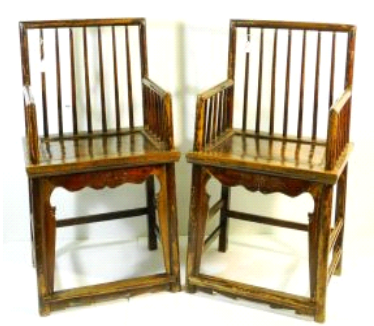
Lot # 243 243 Pair of Ming straight back chairs.