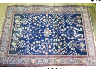
Lot # 204 204 Persian semi-antique rug, approx. 4' x 6'2". $400 - $600

205 Good quality banjo style mercury barometer with thermometer.