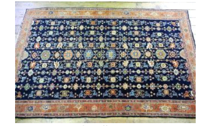
Lot # 259 259 Persian semi-antique rug, approx. 4' 8" x 7'8". $400 - $600 260 Oriental framed embroideries. $20 - $40