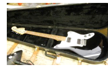
Lot # 438