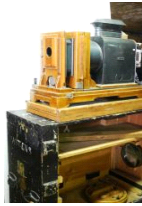
Lot # 418