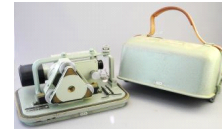
Lot # 459