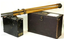
Lot # 405