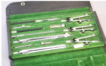
Lot # 452