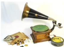
Lot # 403