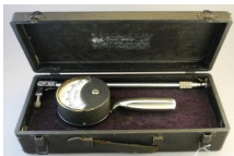
Lot # 458