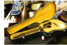
Lot # 464