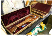
Lot # 448