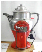
Lot # 404