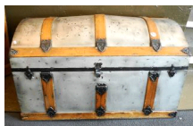
Lot # 423