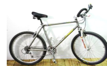
Lot # 465