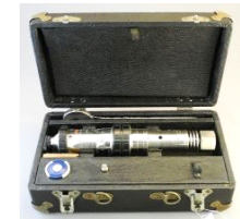
Lot # 415