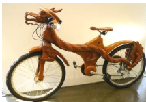
Lot # 406