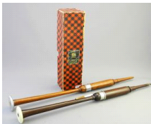
Lot # 455