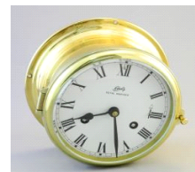
Lot # 413