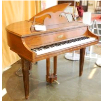
Lot # 402