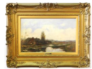
Lot # 221 221 Oil on canvas signed W.A.Knip, 14" x 24", "Farm House".