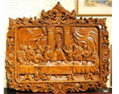
Lot # 75 75 Carved wooden plaque, "The Last Supper". $75 - $125 76 Pair of Tekke woven bags. $250 - $350 77 Antique shadow box. $40 - $60