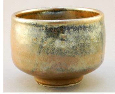
Lot # 177 177 Wayne Ngan pottery pot, 4 3/4" in diameter. $150 - $250