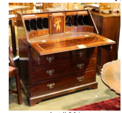
$100 - $200

Lot # 201 $50 - $100 201 Victorian inlaid mahogany bureau. $100 - $200