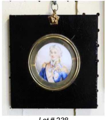
Lot # 238 238 Miniature painting of Lord Nelson, 2 1/2" diameter.