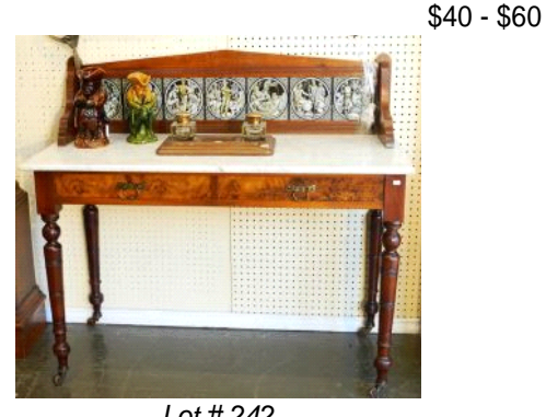
Lot # 242 242 Marble topped tile back walnut washstand. $100 - $150

243 Watercolour unsigned, 18 1/2" x 12", "Cathedral Kitchen".