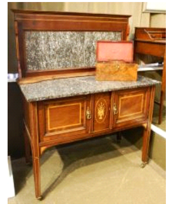
Lot # 191 191 Victorian marble topped washstand.