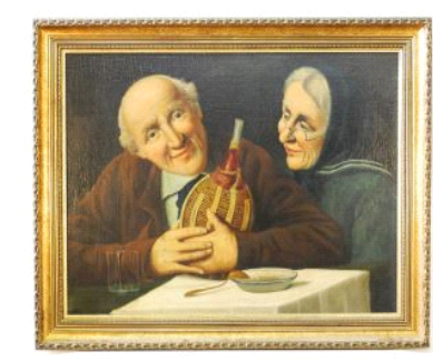
Lot # 197 197 Oil on canvas unsigned, 22" x 16 1/2", "Couple Celebrating". $100 - $150