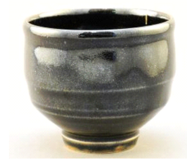
Lot # 178 178 Wayne Ngan pottery pot, 4" in diameter. $150 - $250