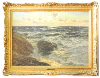
Lot # 67 67 Oil on canvas signed P.V.Kalckreuthi 24" x 36", "Crashing surf". $250 - $500

68 Large collection of Antique and other plates decorated with pheasant $50 - $100