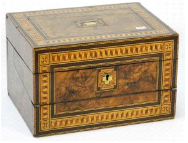
Lot # 223 223 Antique marquetry and walnut lap desk, 11 3/4". $75 - $125