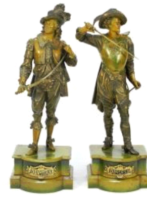
Lot # 222 222 Pair of bronzes "Don Juan" and "Don Caesar", 21".