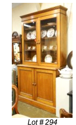
294 19th Century Canadiana Walnut Double Door Bookcase, 85 1/2" High.

$200 - $400 295 Georgian Mahogany Wash Stand, 30 5/8" High $50 - $100