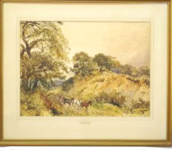
Lot # 229 229 Pair of Watercolours Monogrammed JP (James Price RBA), 14 1/4" x 21".