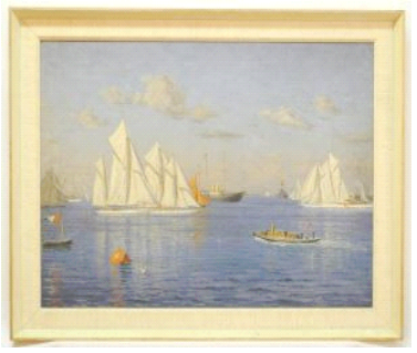
Lot # 31 31 Oil on Canvas Signed Byron Cooper, 17 7/8" x 23 7/8", "Regatta Scene".

30 2 Georgian Oak Spindle Chairs, One With Arms, 37 1/2 & 41 1/2" High $50 - $100