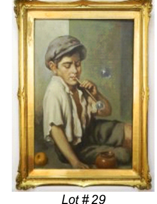
29 Oil on Canvas signed Valentini, "Blowing Bubbles" 27 1/4" x 19 1/4".

28 Pair of Equadorian Brass Stirrups, 10 1/2" Length. $50 - $80