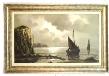
Lot # 159 159 Oil on Canvas Signed Francois Carbu, 21" x 39", "Coastline with Fisherman".