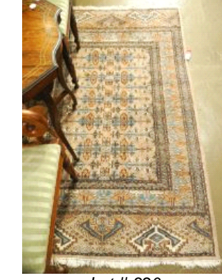
Lot # 320 320 Hand Knotted Persian Carpet, Blue & Terracotta Tones Spot Noted Approx. 78"X50".