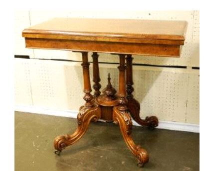
Lot # 314 314 Mid 19th Century Inlaid Walnut Quattro Columnar Games Table, 29 1/2 x 35 3/4 x 17 1/2".

$200 - $300 315 Collection of 6 Brass Candlesticks, 4 Pair 9"H. $60 - $100