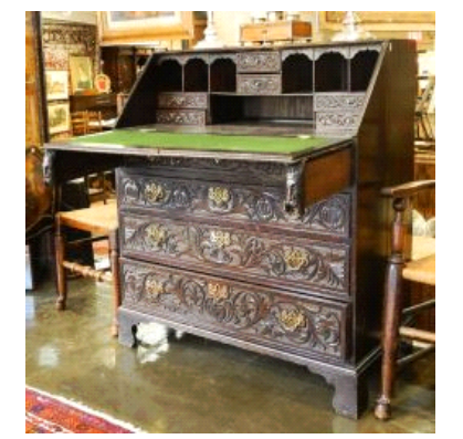
Lot # 34 34 19th Century Carved Oak Bureau, 44" High. $200 - $300

33 Staffordshire figure of Garibaldi & Horse, 14 1/2". $100 - $150