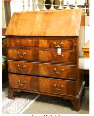
Lot # 316 316 Georgian Mahogany Bureau, h 42 1/2" x 37 1/2" W.

$200 - $300 315 Collection of 6 Brass Candlesticks, 4 Pair 9"H. $60 - $100