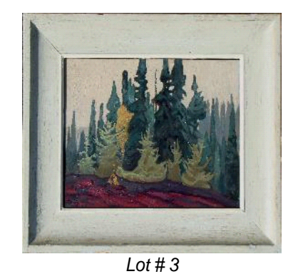
3 Oil painting on panel signed Lawren Harris, 10 5/8" x 13 3/4", "Lake Superior Country".