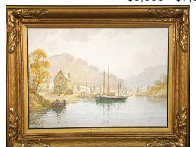
Lot # 34 34 Watercolour signed Hannaford, d.1948 14" X 21", "A Devonshire Fishing

Haven, Noss - Near Plymout $1,000 - $1,500