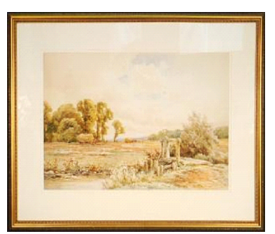
Lot #27 27 Watercolour signed Henry H. Parker, 14 1/4" x 21 1/4", "Haymakers". $800 - $1,000