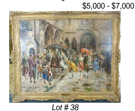
38 Oil painting on canvas signed M.J. Caballero, 28 in. x 39 in., "Interior Courtyard Scene" $3,000 - $5,000