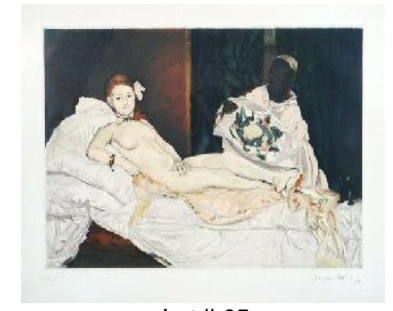
Lot # 65 65 Col.ltd.ed. etching & aquatint sgnd. Jacques Villon'26,numbered 82/100, "Olympia"(after Manet). $1,500 - $2,000