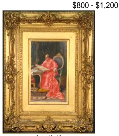
Lot # 42 42 Oil painting on panel signed R. Oliva, 10 1/2" x 15 3/4", "Cardinal Reading". $1,500 - $2,500