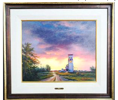
Lot # 19