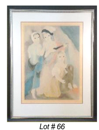
66 Col.ltd.ed.print sgd.Marie Laurencin numb.96/100 23"x19", "Three Young Ladies with Mandolin & Dog $800 - $1,200