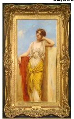
Lot #24 24 Oil painting signed W. Oliver, 13" x 24", "Happy Thoughts".