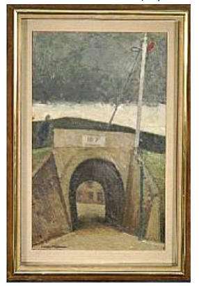
Lot # 56 56 Oil painting on masonite signed George Chapman, 19" x 13", "The Low Bridge".