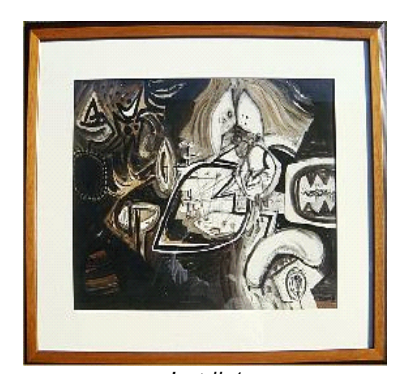
Lot # 1 1 Ink and sepia on paper signed J. Shadbolt '49, 22" x 27 1/2", "Expansion of seed".