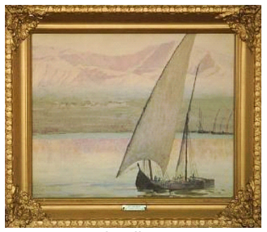
Lot # 41 41 Watercolour signed R. Talbot Kelly, 14 1/2"x 19 1/2", "On the Nile".