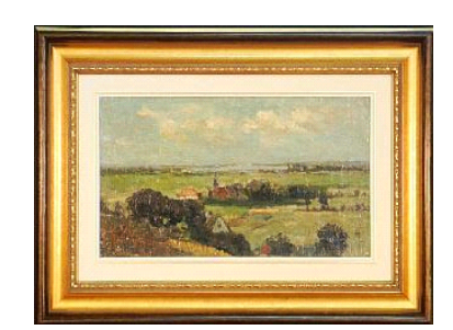
Lot # 47 47 Oil on board indistinctly signed, 8 3/4" x 15 3/4", "Hague - City Landscape".