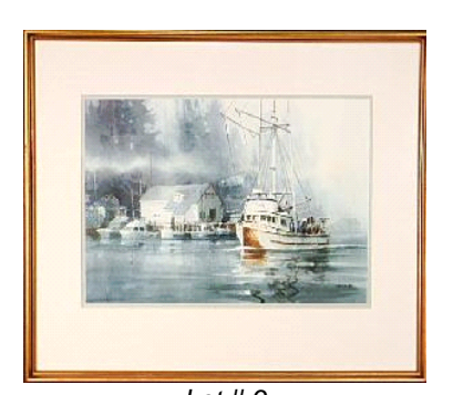
Lot # 9 9 Watercolour signed Heine, 13 in. x 20 1/2 in., "Sea Fury" (Bamfield).