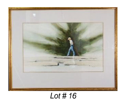
16 Framed watercolour signed Keith Hiscock, 14 3/4"x 26", "Log Walk". $800 - $1,200