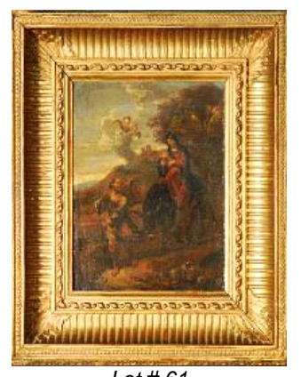
Lot # 61 61 Oil on canvas in the style of Murillo, 11 1/2" x 8 1/2", "Flight into Egypt" $800 - $1,200