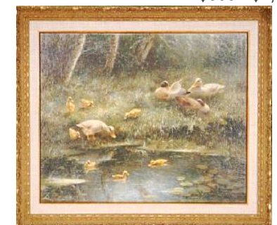
Lot # 63 63 Oil on board signed H. Breedveld, 12" x 15 1/2", "Ducks and Ducklings by a Pond".