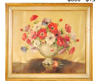
Lot # 17 17 Oil painting on canvas signed G. Rock, 14" x 18", "Floral Study Pansies".