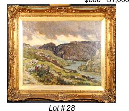
28 Oil painting on canvas signed Hugh Stanton, 18" x 24", "Passing Showers".