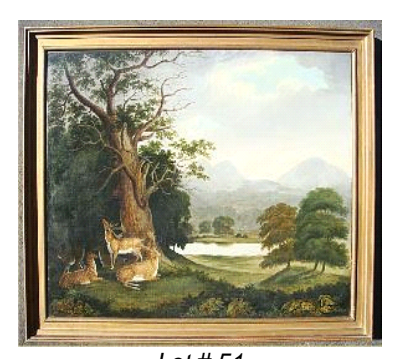
Lot # 51 51 Oil painting on canvas signed C. Towne, 24" x 30 1/4", "Landscape with Deer".