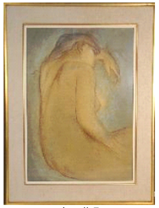
Lot # 5 5 Pastel signed Muhlstock, 25 in. x 19 in., "Nude".