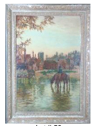
Lot # 53

53 Oil on board signed W.H. Bartlett, dated 1919, 23" x 17 1/2", "Chalpont St. Giles".