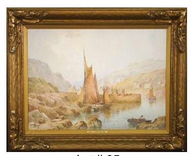
Lot # 35 35 Watercolour signed Hannaford, d.1941 14" x 21", "Polperro, Cornwall". $1,000 - $1,500