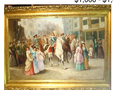
Lot # 54

54 Oil painting signed G. Gordon, 30" x 50", "Restoration of Charles II to the Throne".