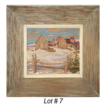
7 Oil painting signed A.Y. Jackson, 8 1/2" x 10 1/2", "Farm, St. Tite Des Caps". $20,000 - $30,000