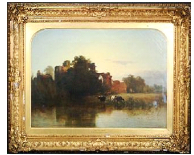
Lot # 46