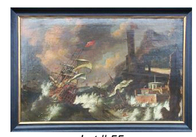
Lot # 55 17th / 18th century oil on canvas, unsigned, 36 1/2" x 61 3/4", "Sovereign of the Sea".