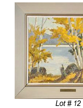
12 Oil painting signed Tom Roberts, 11 3/4" x 16", "Autumn Birches - McMaster Lake".