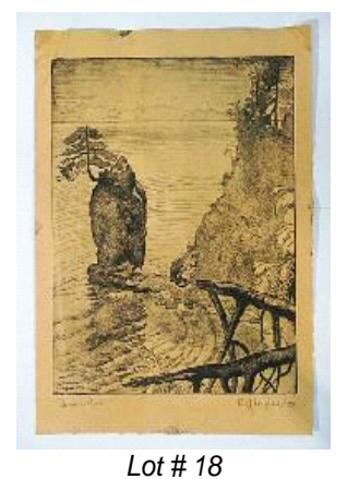
18 Engraving signed E.J.Hughes '35, 11 1/8 in. x 9 in., "Siwash Rock".