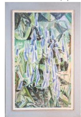
Lot # 15 15 Watercolour signed Parasevka Clark, 29 1/2 in. x 19 1/2 in., "Veronica Spicita".