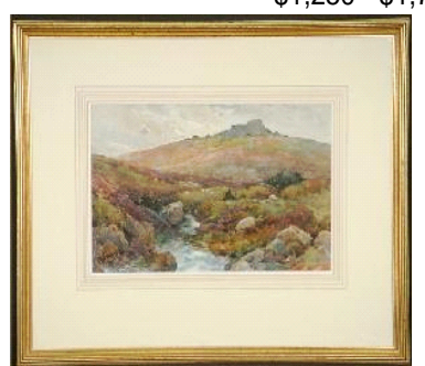
Lot # 40 40 Watercolour signed A.De Breanski, 8 1/2 in. x 13 1/2 in., "Sheep By Highland Stream"