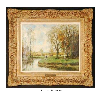
Lot # 39 39 Oil on canvas signed W. Hendriks, 12 1/2" x 16 1/2", "Autumn, Grazing in a Meadow".