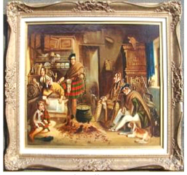
Lot # 49

49 Oil painting on canvas signed Alex Fraser, 25" x 30", "Return from The Hunt".