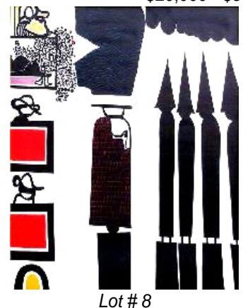
8 Oil painting on burlap signed H. Town '63, 81" x 74", "Auto da Fe Don Carlos". $20,000 - $30,000