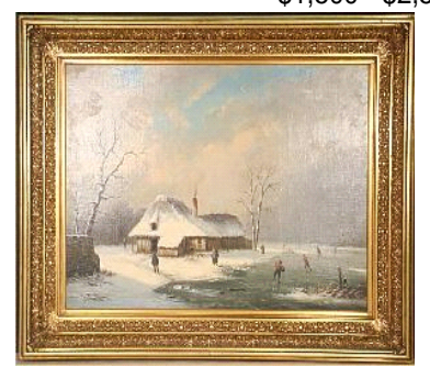
Lot # 26