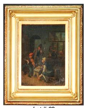
Lot # 62 62 Oil on canvas in the style of David Teniers, 11 1/2" x 8 1/2", "In the Tavern".