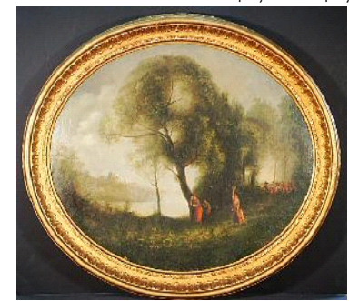
Lot # 58 58 Oval oil painting on canvas signed Corot 1870, 25 1/2" x 32" "Dancing in a Woodland Glade".