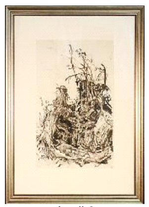
Lot # 6 6 Ink and charcoal signed A. Lismer, 17" x 11 1/4", "Study of Forest Growth". $2,500 - $3,500