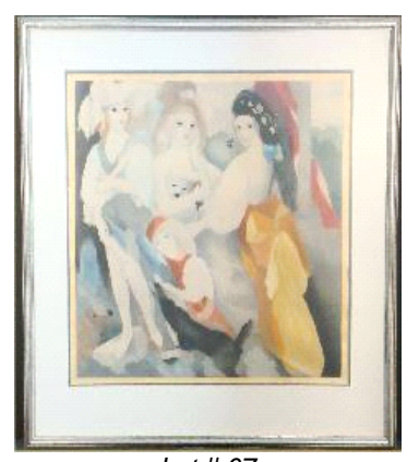
Lot # 67 67 Col.ltd.ed.print sgd.Marie Laurencin num.45/100 21"x21", "Four Young Ladies with Two Dogs".