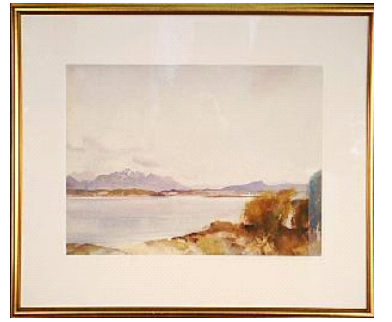
Lot # 36 36 Watercolour signed W. Russell Flint, 13" x 19 1/2", "Ben Cruchan". $3,000 - $5,000