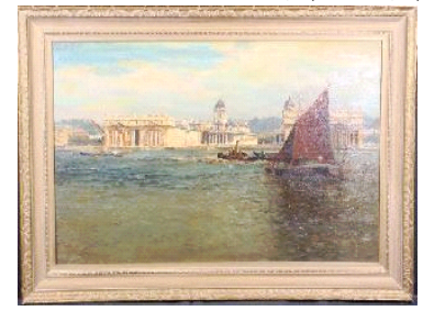
Lot # 52 52 Oil on board signed W.H. Bartlett, dated 1910, 17" x 27", "Greenwich Hospital and the Thames".