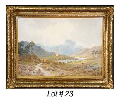
23 Watercolour signed Hannaford, 18"x 28", "Balmoral Invernesshire, Scotland".