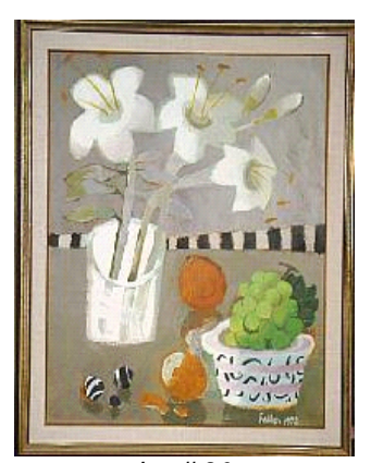
Lot #20 20 Oil on canvas signed Fedden, (Mary Fedden),1978,23 1/2" x 19 1/2,"Still Life-Flowers & Fruit".