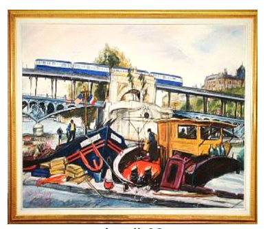
Lot # 68 68 Oil pastel on paper signed Sheldon C. Schoneberg, 30 in. x 40 in., "Viaduc Passy Paris"