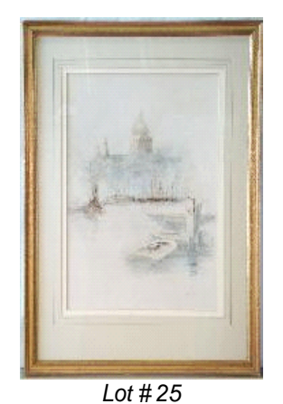
25 Watercolour signed H.S. Tuke, 12 1/2" x 17 1/2", "St. Paul's Cathedral".