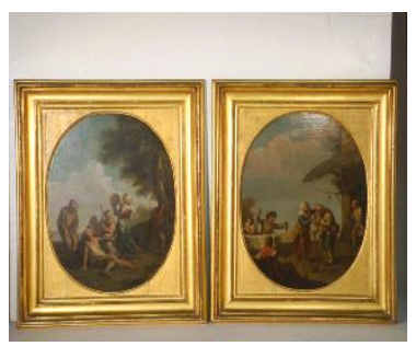
Lot # 33 33 Pair of o/p's attr. to Pieter van Laer Bamboccio, 17 1/4" X 13 1/2", "Resting at an Inn".