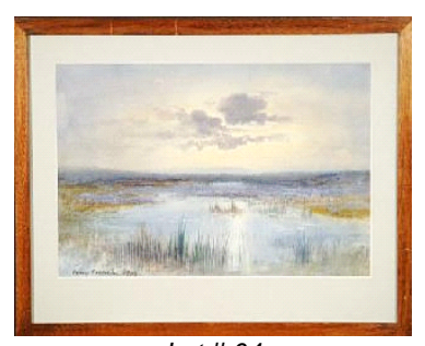
Lot # 64 64 Watercolour signed Percy French 1903, 11" x 17 3/4", "Irish Marsh Scene".