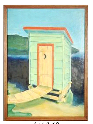
Lot # 13 13 Oil painting on board signed C. Furey '87, "Landscape with Trees".