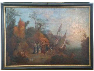
Lot # 57 57 Pair of early unsigned paintings on canvas, 25 in. x 39 in., "European Coastal Scenes".