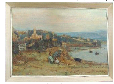
Lot # 32

32 Oil painting on canvas signed J. Buxton Knight, dated 1890, 28" x 44" ,"Coastal Scene".