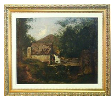
Lot # 43 43 Oil on canvas signed Mihaly Munkacsy, 18" x 24", "Untitled Landscape".