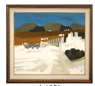
Lot #21 21 Oil painting on canvas signed Fedden (Mary Fedden),1977, 16 in. x 20in., "Lanzerote"