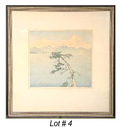
4 Woodblock print signed W.J. Phillips , 10 1/2" x 12", "Howe Sound, BC". $5,000 - $7,000

The next scheduled Specialty Auctions are: Fine Art - Oct 27 2008 Collectable - Nov 11 2008 Playland - Nov 25 2008 Antique & Art - Dec 08 2008 BeDazzled - Dec 16 2008