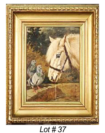
37 Oil painting signed J. Emms 15" x 12 3/4" "At the Trough".