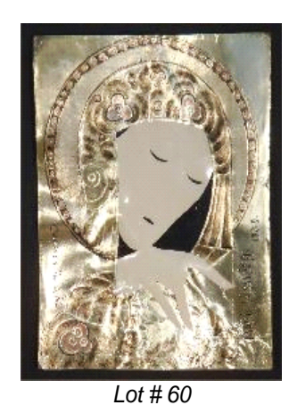
60 Mixed media collage signed Marie Vassilieff 1939-Cagnes s/m AM,12'x 9 1/2", "White Madonna"