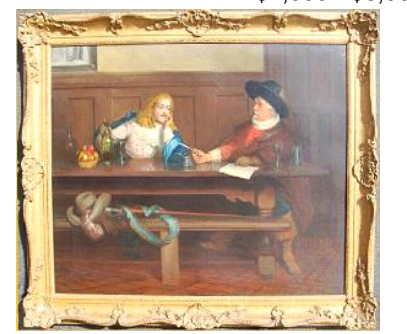
Lot # 44

44 Oil painting on canvas signed Clifford Waterloo 1884, 28" x 36", "Charles II and Supporter"