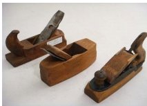
Lot # 424