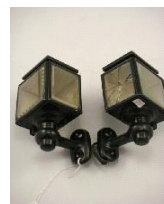
Lot # 488