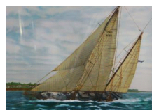
Lot # 458