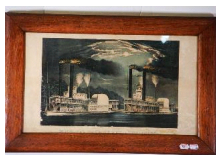
Lot # 442