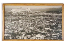
Lot # 445