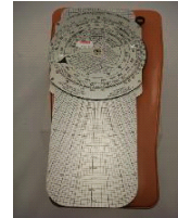
Lot # 414