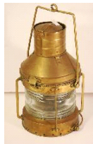
Lot # 426