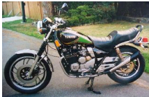
Lot # 502