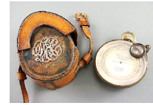
Lot # 433

433 E.P.Watts & Son pocket Surveying Aneroid Compensated barometer in a leather case.