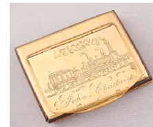
Lot # 434