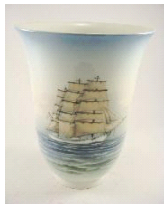
Lot # 404