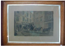
Lot # 499