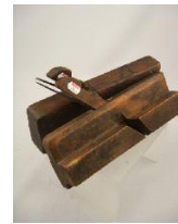
Lot # 413