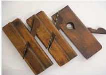
Lot # 423