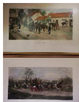
Lot # 470