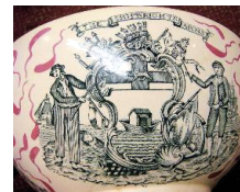
Lot # 420