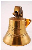
Lot # 401