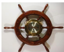
Lot # 443