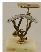
Lot # 489