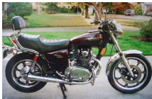
Lot # 503