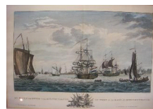
Lot # 459