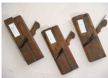
Lot # 405