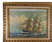
Lot # 498