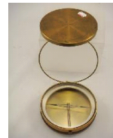
Lot # 419