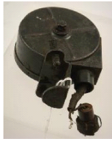
Lot # 422