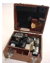
Lot # 477