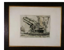
Lot # 441

441 Engraving signed Percy Smith dated in plate 1916, 8" x 9 1/2", "World War One Gun".