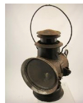
Lot # 466