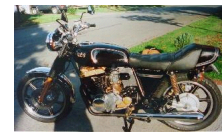
Lot # 437

437 Rare one of a kind custom built 1977 Yamaha XS750 GLS special.