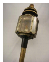
Lot # 461